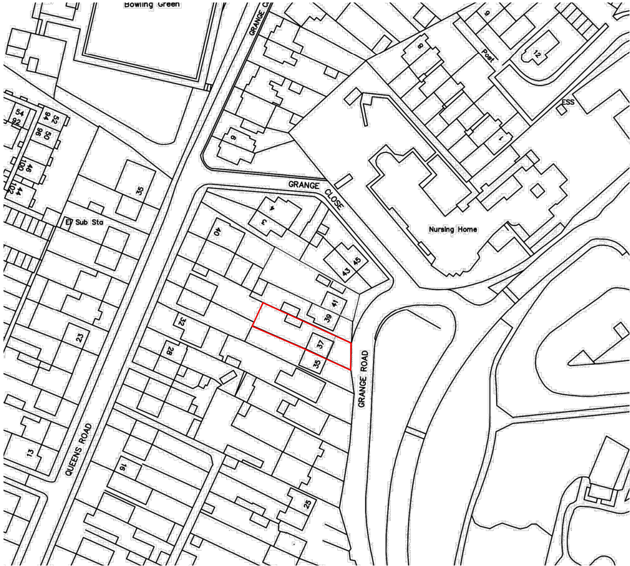
01 - OS MAP SCALE 1:1250