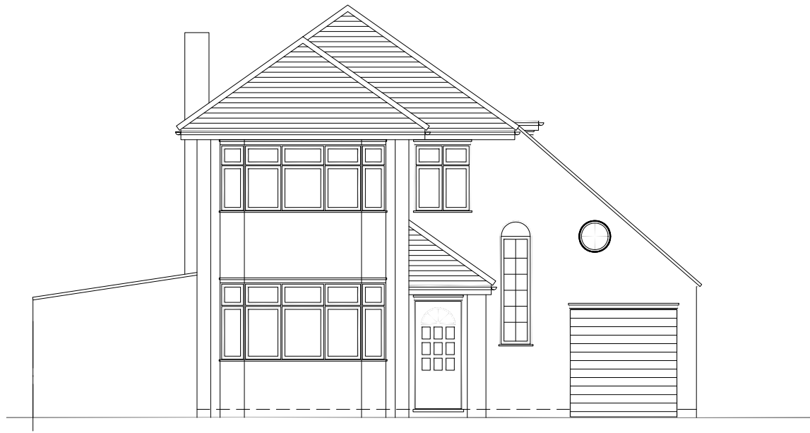
Pre Existing Front Elevation