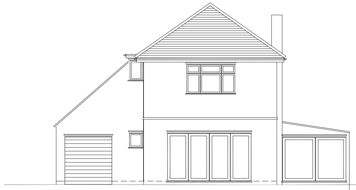
Pre Existing Rear Elevation