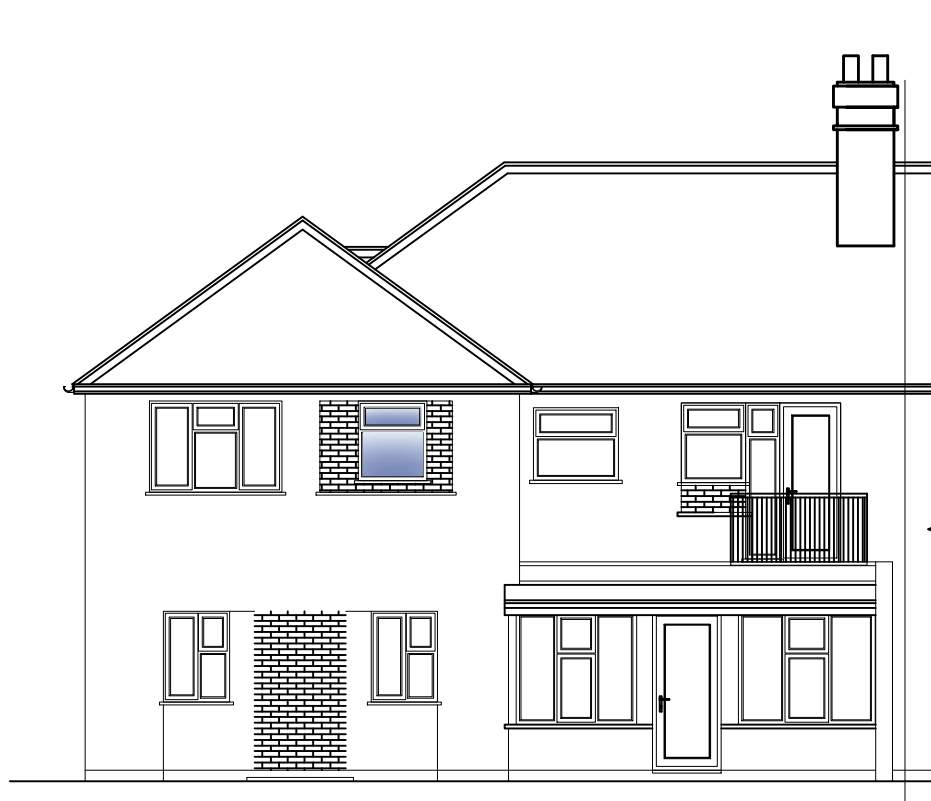
Rear Elevation Scale 1:100