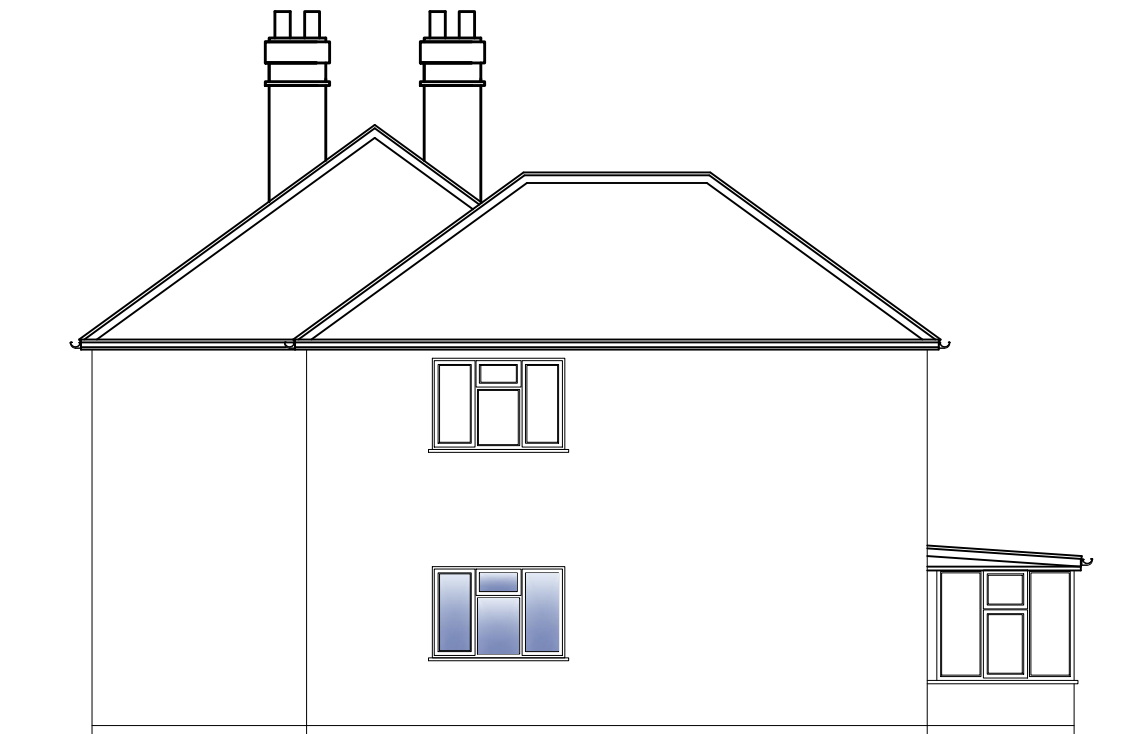
Side Elevation Scale 1:100