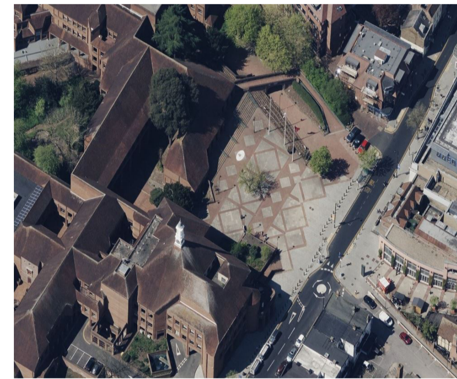
Birds Eye View of the Forcourt showing step free access , ramp and main stairs pedestrian access. (Looking West)