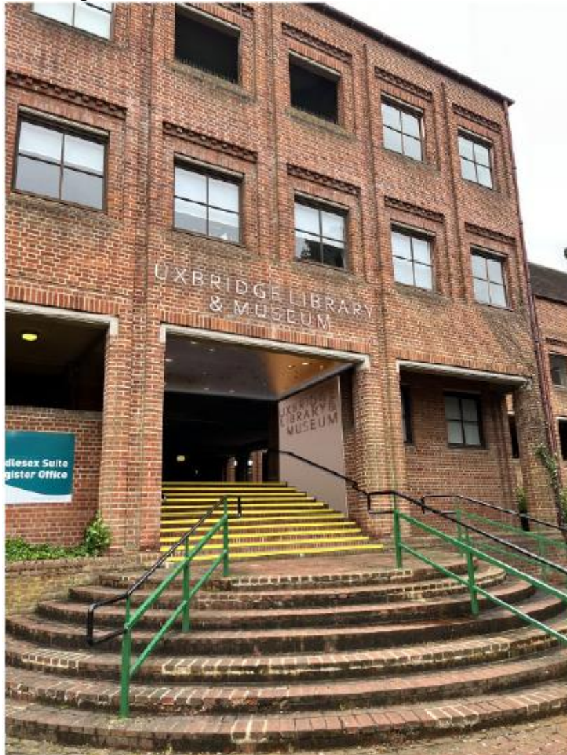
Figure 4: Proposed Signage at the Front Elevation of the Grade II Listed Building.

contextual design approach that recognises the prominence of the front elevation and detailing of the Grade II Listed Building, as these would be modest in size.