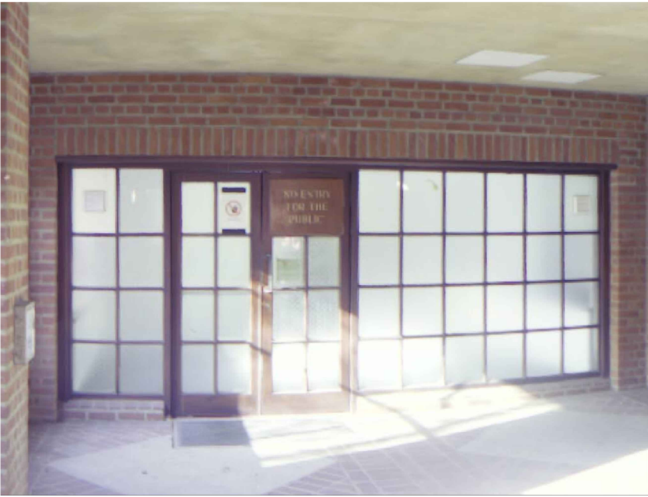
Photo of the existing glazed partition