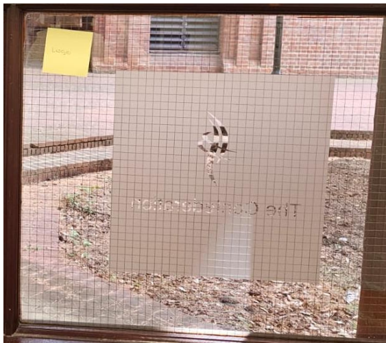
All views from inside the office