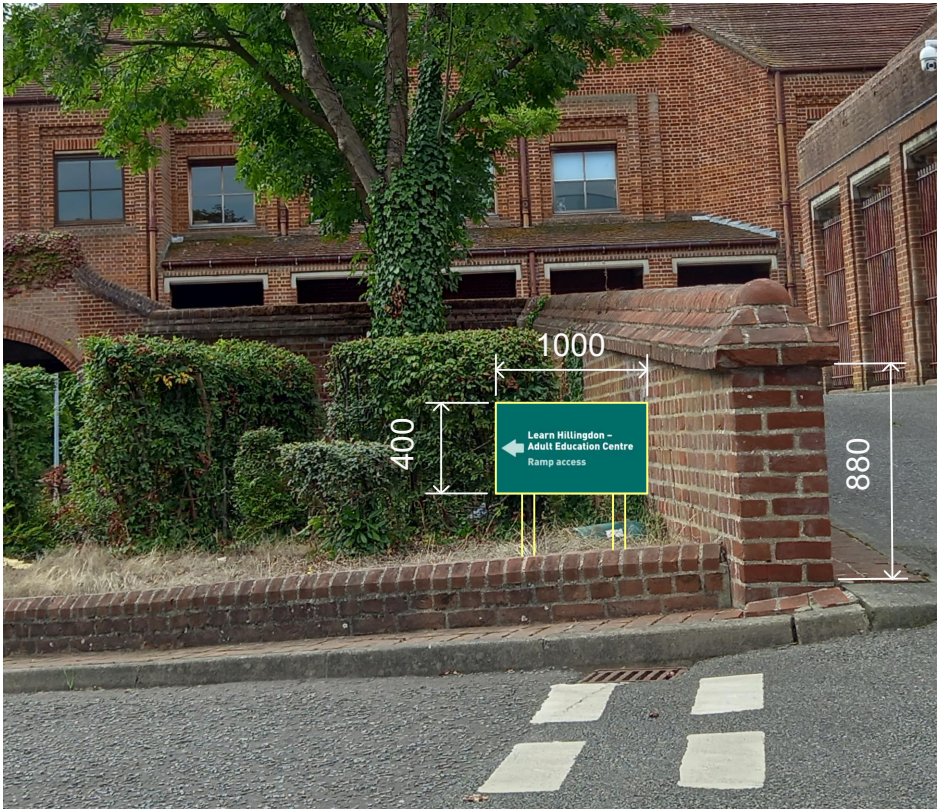
PROPOSED VIEW OF SIGNAGE AT LOCATION C