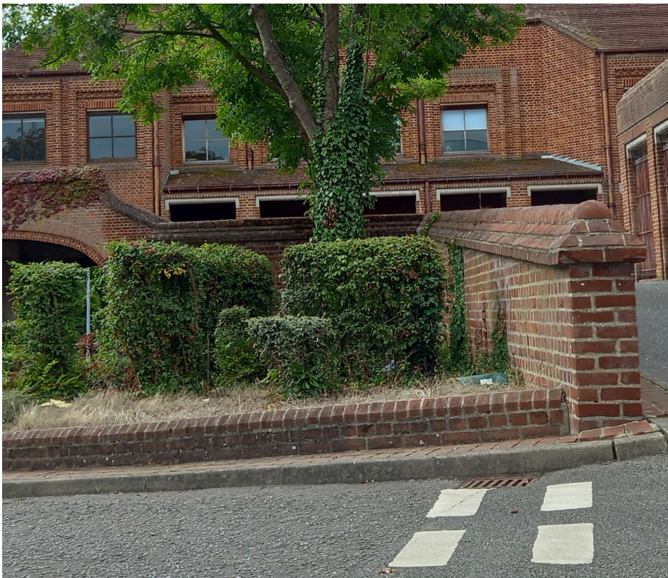
EXISTING VIEW OF LOCATION C