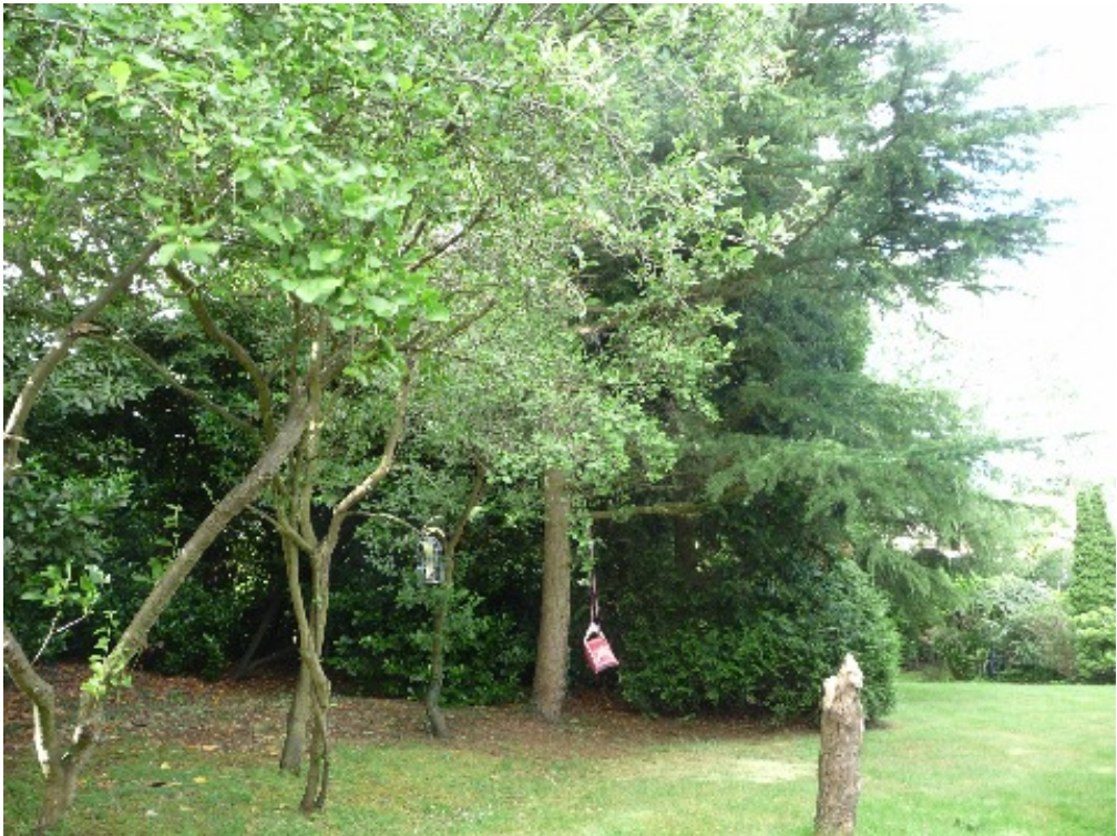
07 - Original garden view