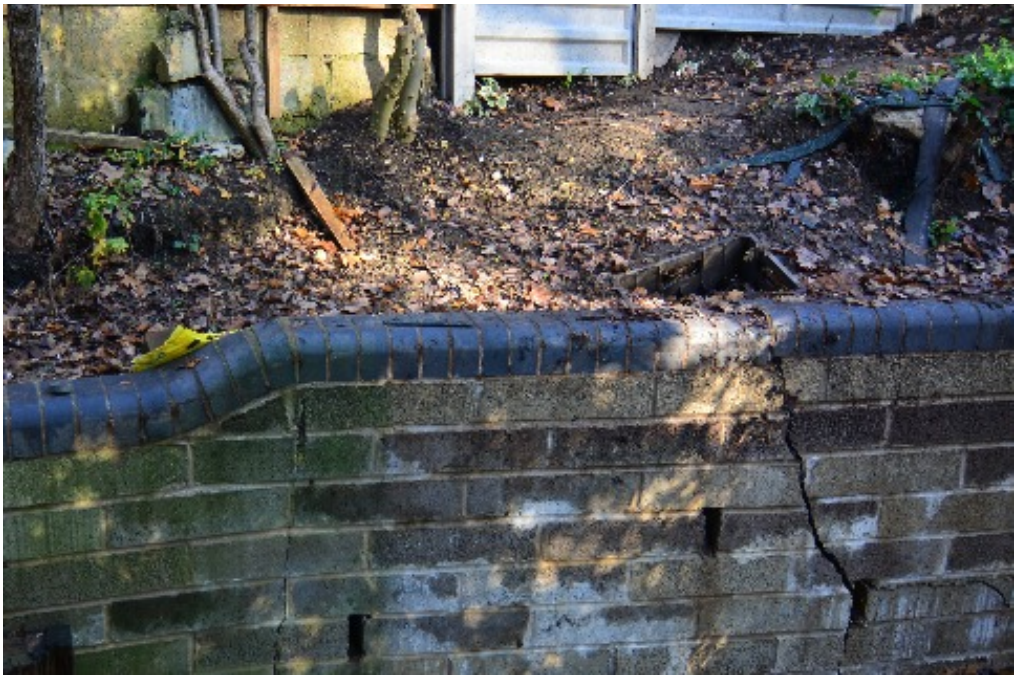
03 - Original garden view - poor condition of retaining wall