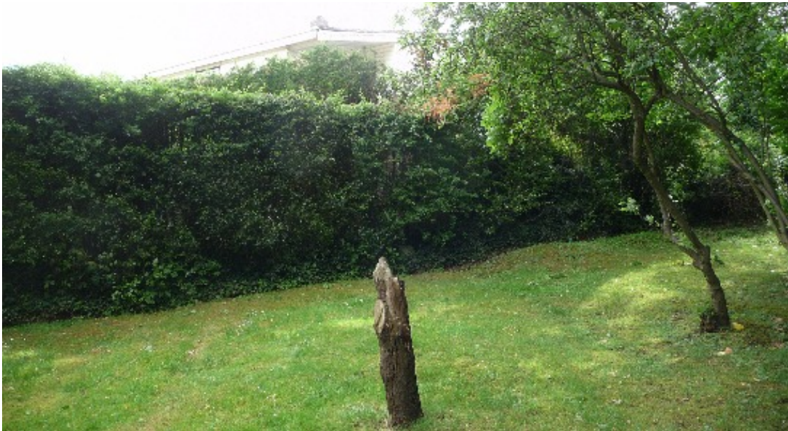
06 - Original garden view