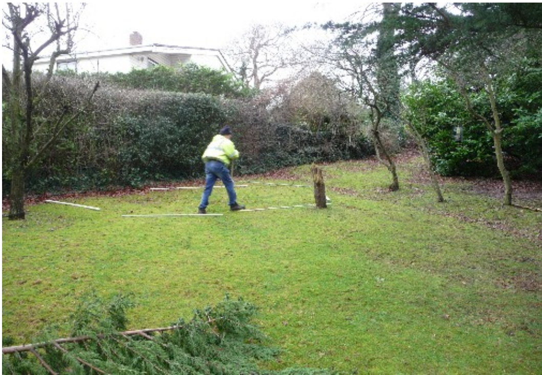
02 - Original garden view