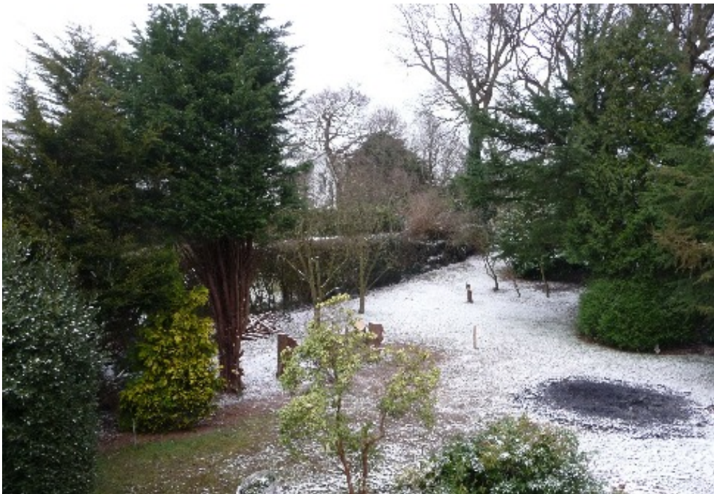
01 - Original garden view