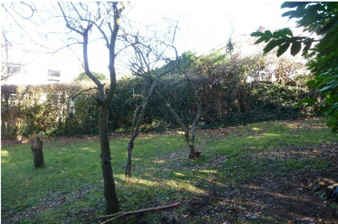
04 - Original garden view

Title Photo - Existing Original Condition Drawing Number 33WA - P02 Date August 22 Purpose PLANNING APPLICATION Project 33 Wieland Rd, London, HA6 3QX Client P Tregunna