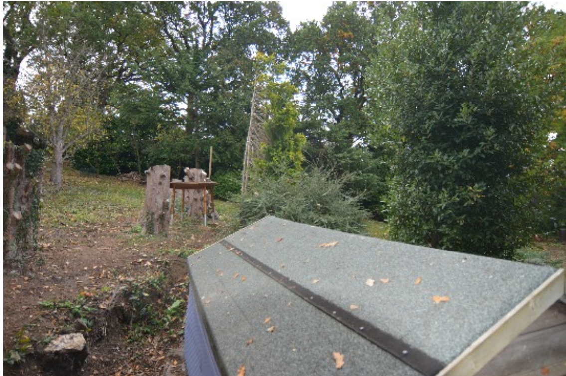
08 - Original garden view

Title Photo - Existign Original Condition Drawing Number 33WA - P03 Date August 22 Purpose PLANNING APPLICATION Project 33 Wieland Rd, London, HA6 3QX Client P Tregunna