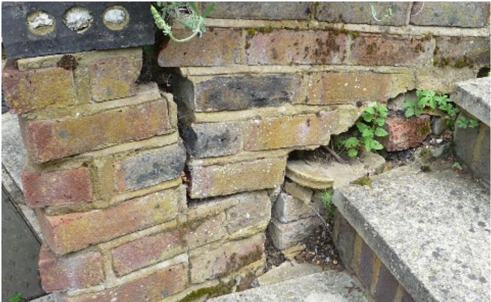
05 - Original garden view - poor condition of retaining wall