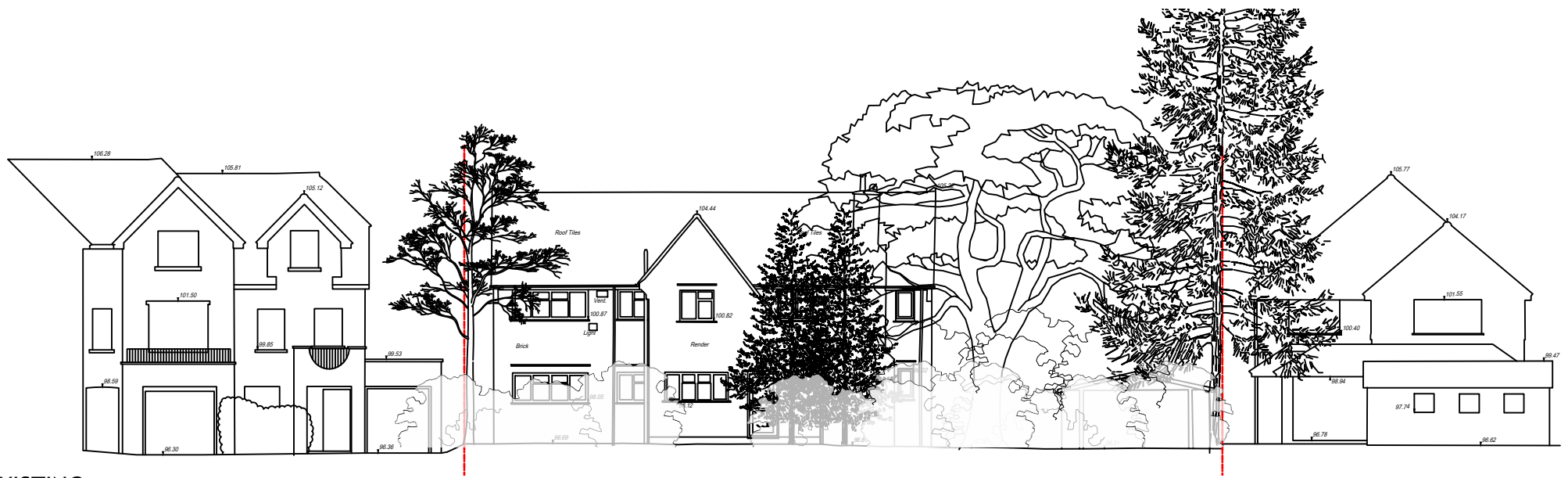
EXISTING: FRONT ELEVATION STREETVIEW IN CONTEXT