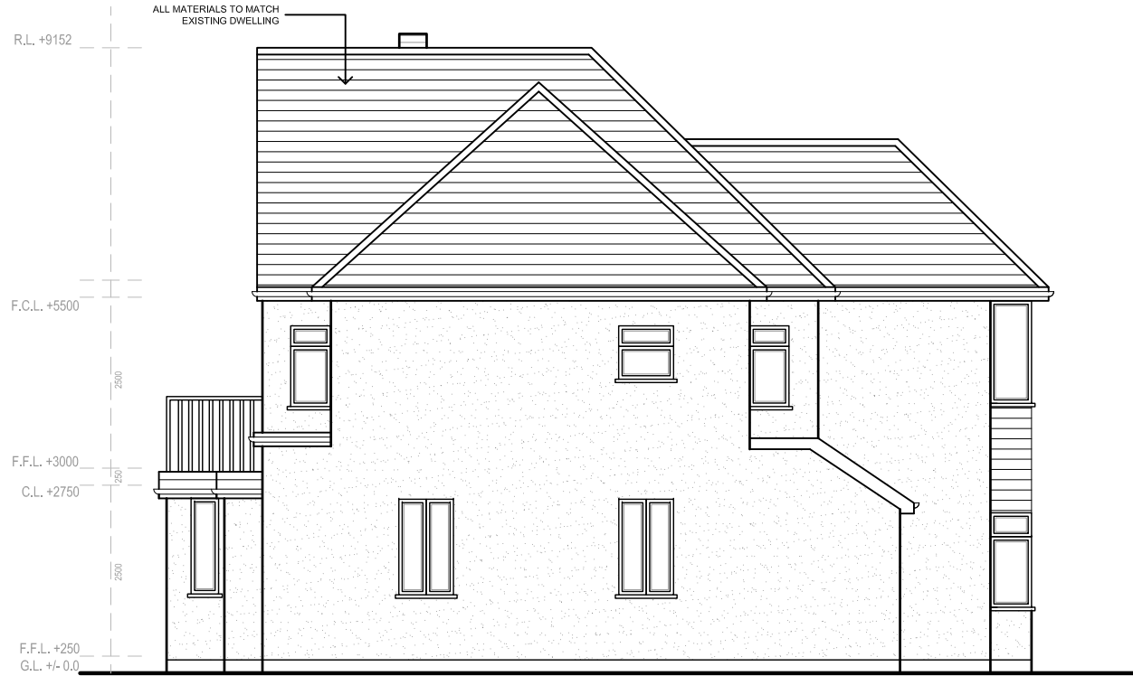
PROPOSED SIDE SOUTH ELEVATION