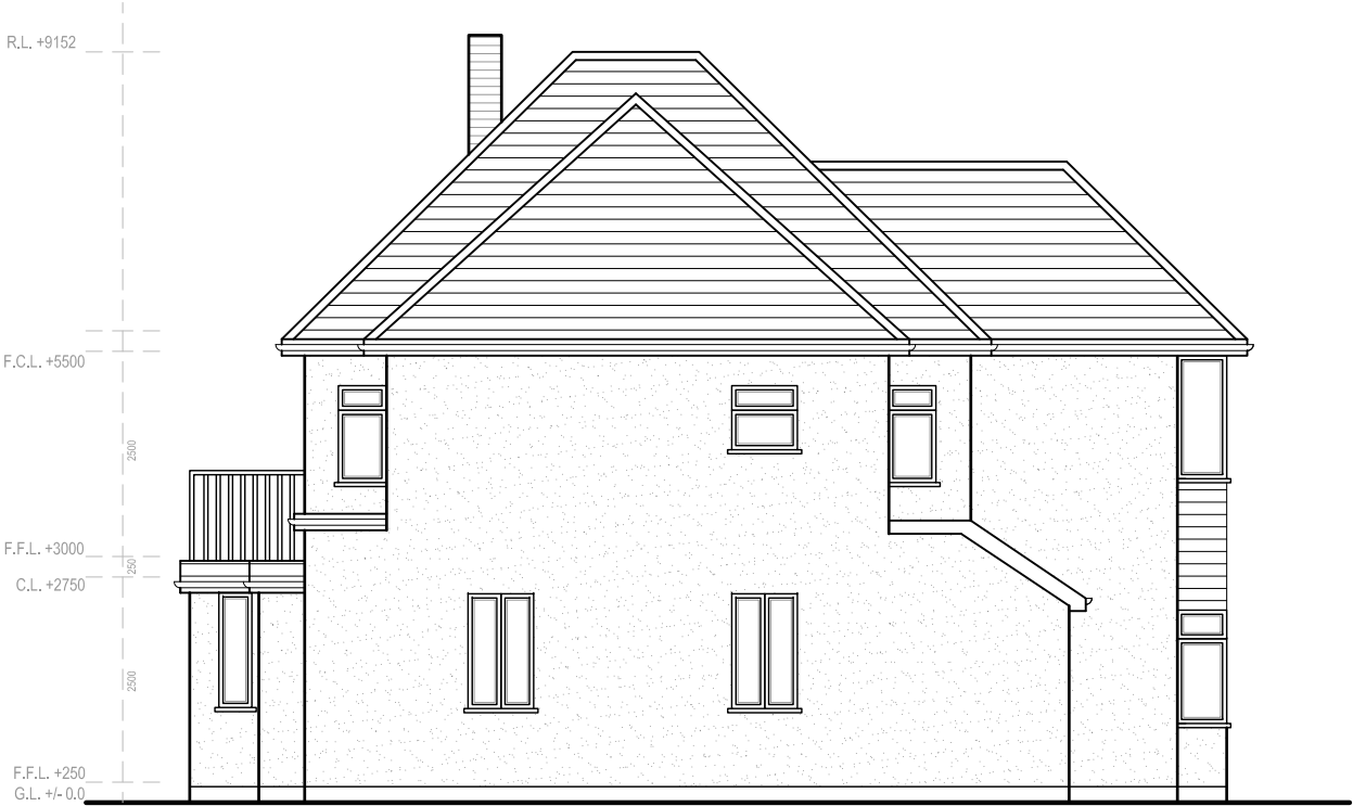
EXISTING SIDE SOUTH ELEVATION