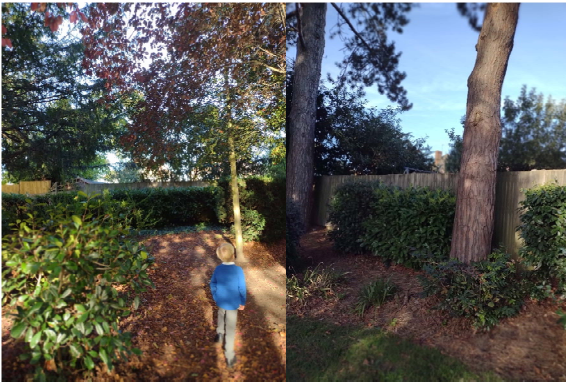
Rear View of the house from the Park