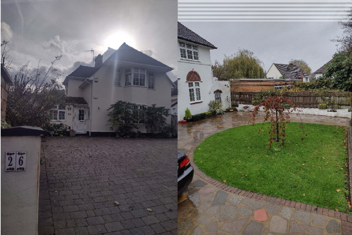
Example: 26 Eastcote Road Side Extension that looks like a Side Dormer and Rear Gable

Juttla Architects Ref: 1932 Date: November 2022 Author: Kevin Padilla