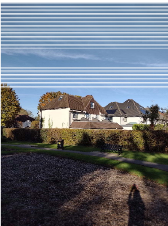
Example: 16 Eastcote Road - Rear Gable with Juliette Balcony