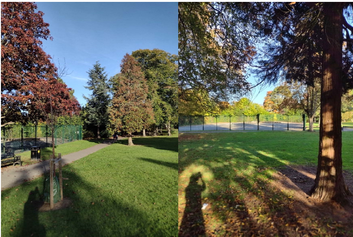
Rear of Site: Large Trees Blocking any Direct Views to Church Fields Gardens Park