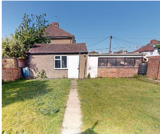
5. Rear garden view of No.28 Dawley Avenue