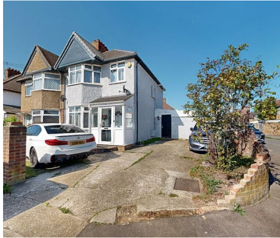
1. Front view of No.28 Dawley Avenue (Application Site)