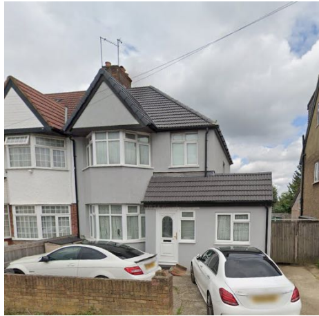
7. No.29 Dawley Avenue opposite No.28