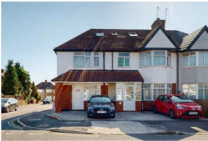
6. Double storey side extension at No.27a and 27 Dawley Avenue opposite No.28