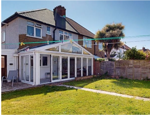
4. Rear view of No.28 Dawley Avenue showing adjoining No.30