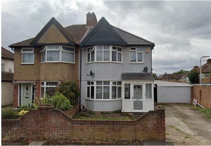
2. Front view of No. 30 and 28 Dawley Avenue