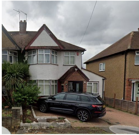
8. No.32 Dawley Avenue