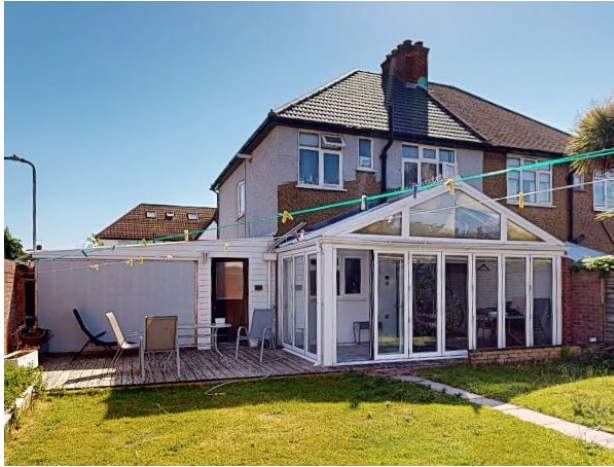
3. Rear view of No.28 Dawley Avenue