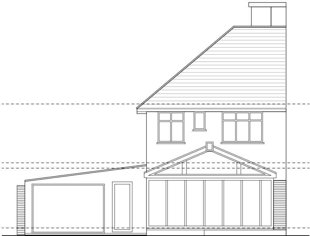
3 SOUTH WEST