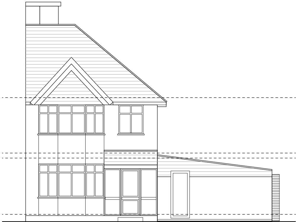
1 NORTH EAST