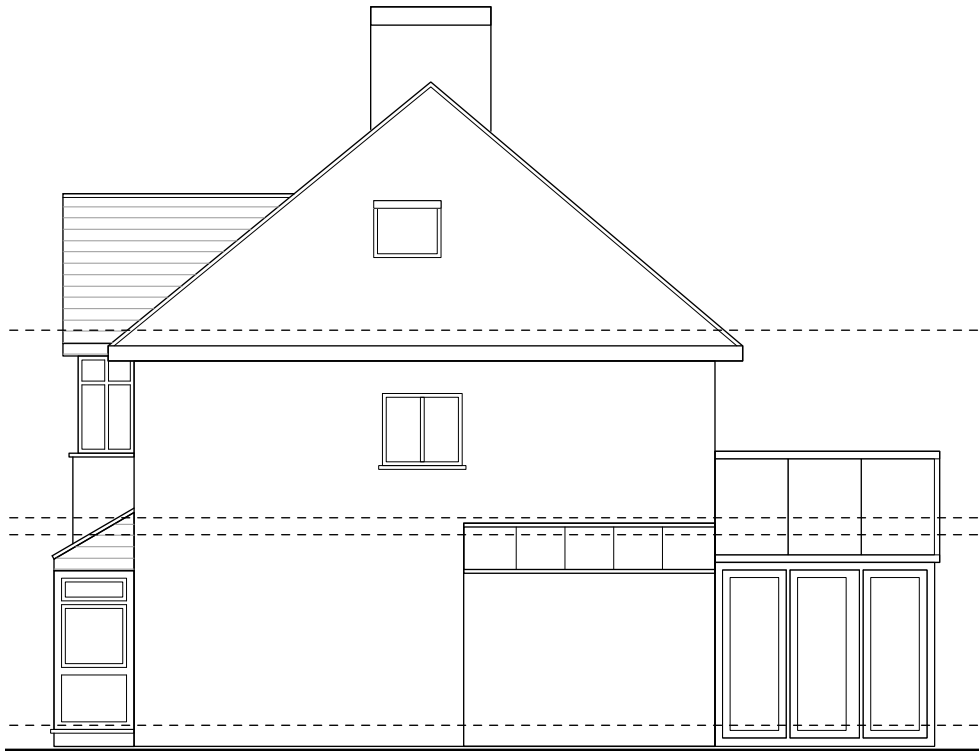
2 NORTH WEST