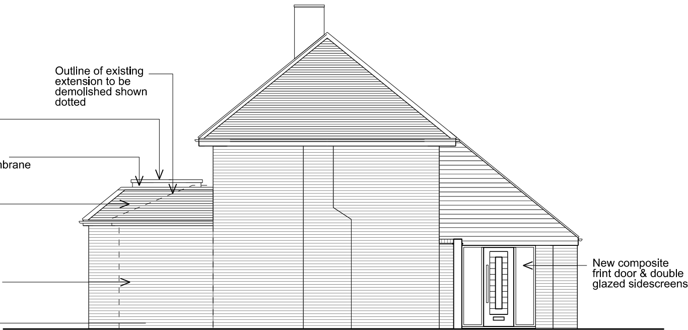
Proposed Side (S.W.) Elevation