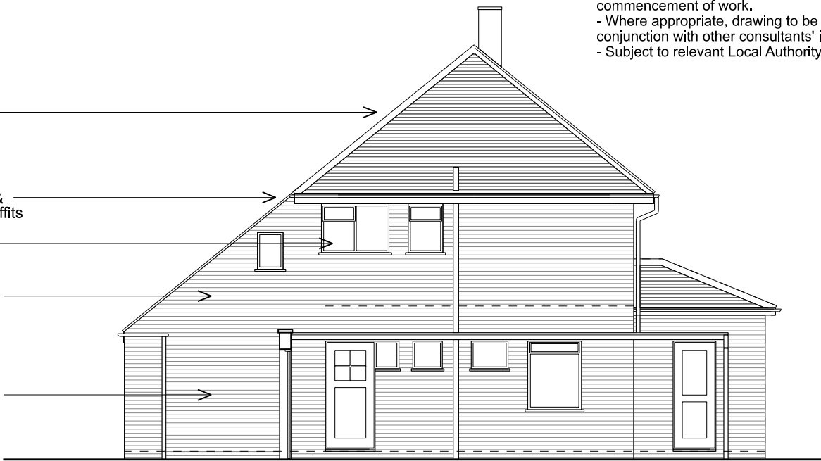
Existing Side (N.E.) Elevation