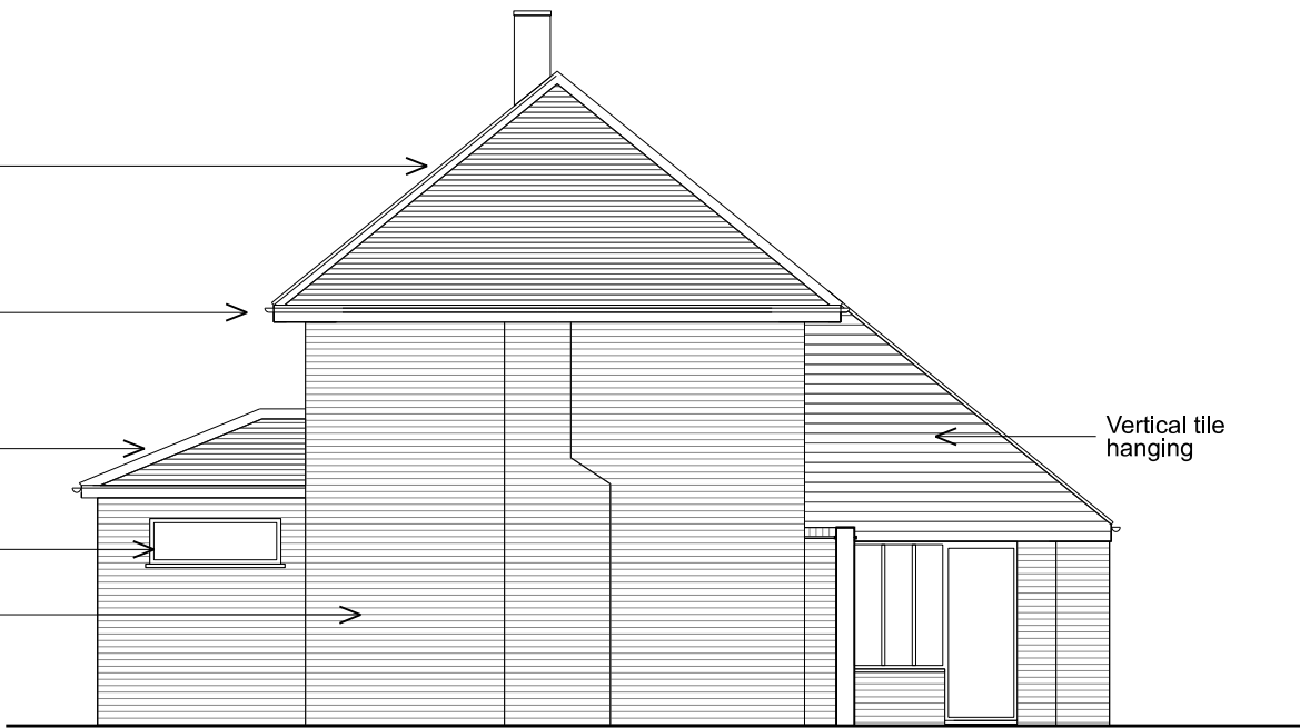
Existing Side (S.W.) Elevation