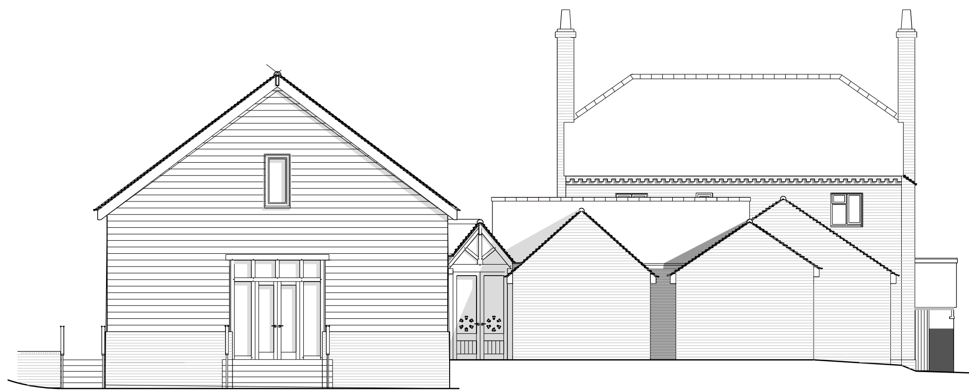
South West Elevation Approval Ref: 14387/APP2023/2594 & 5 1:100 Extract from Approved Drawing VSA20/11 - 011G