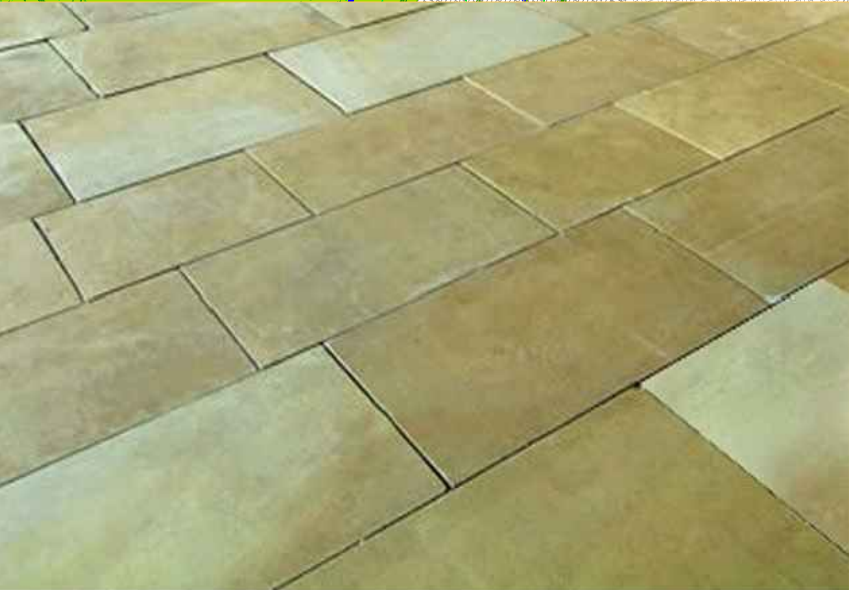
Sandstone paving, buff colour