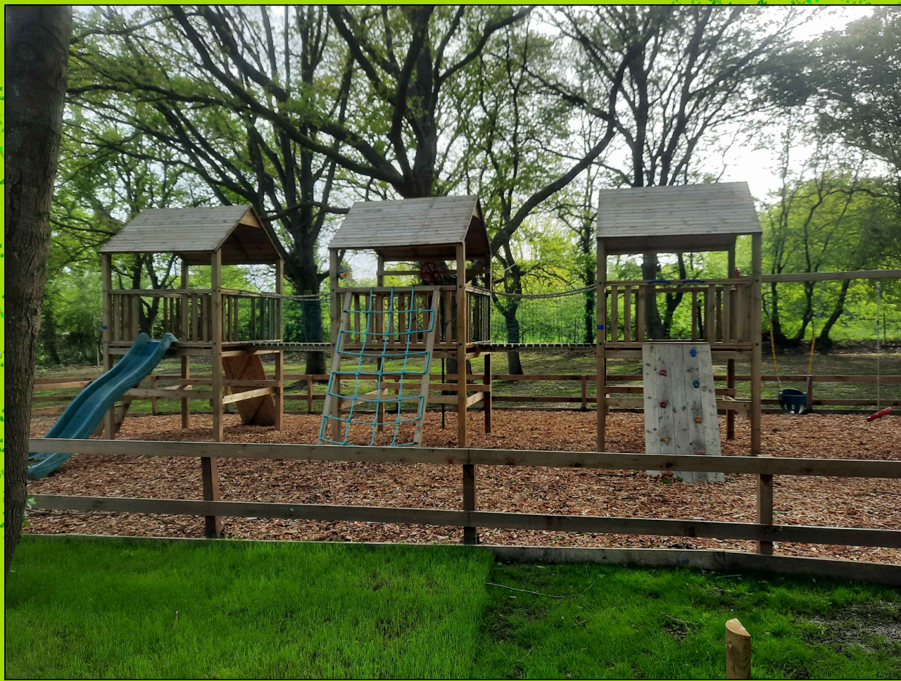
Timber play equipment to be installed in new location shown