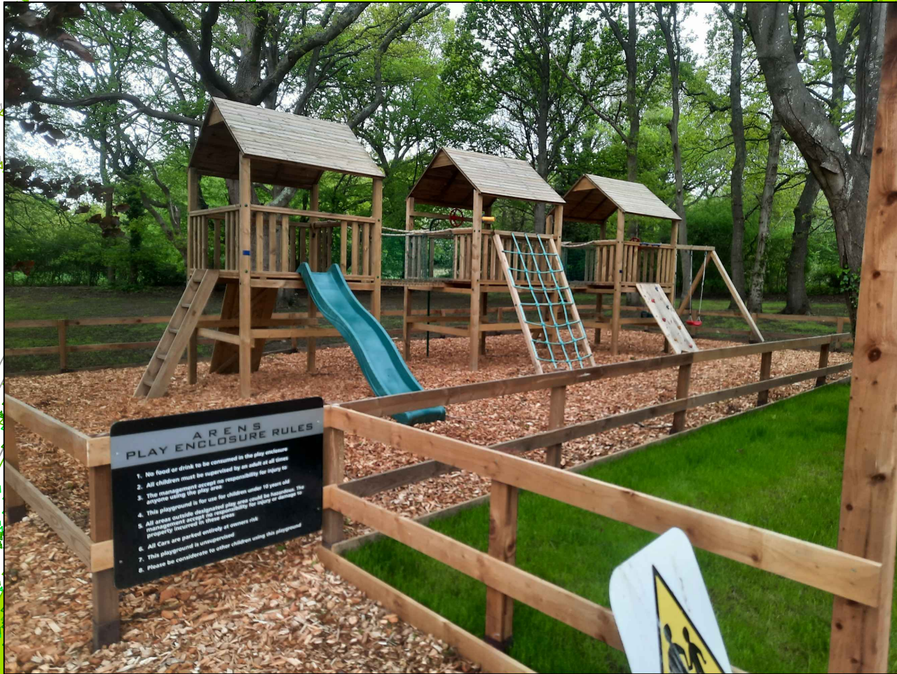
Timber play equipment to be installed in new location shown