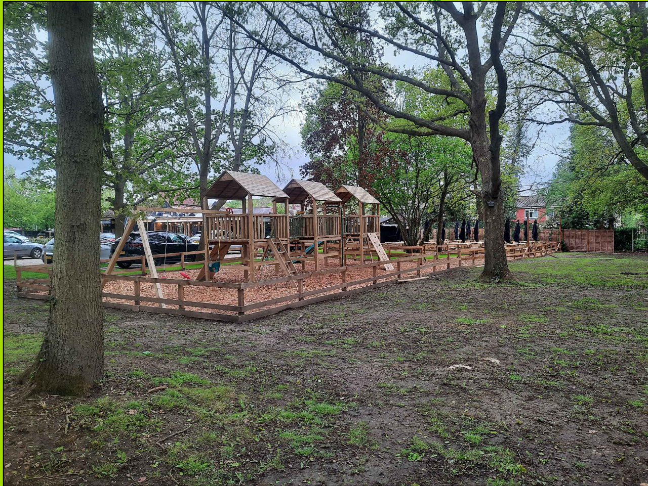
To be enclosed by timber post and rail fence. Surfacing to be chipped play bark