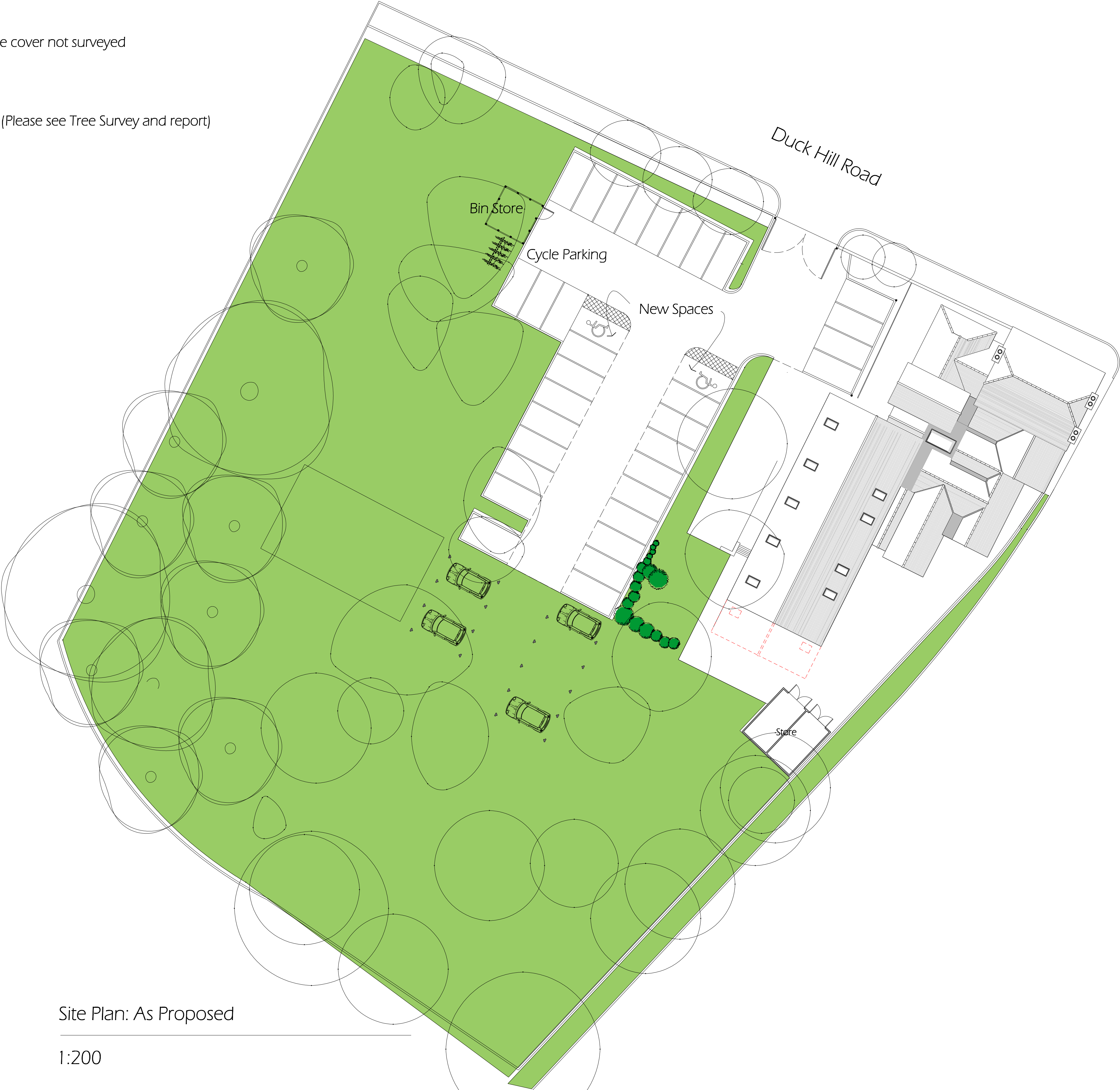
Site Plan: As Proposed

Trees surveyed (Please see Tree Survey and report)