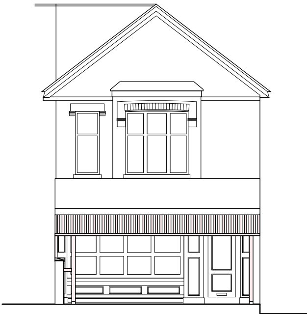
3 EXISTING NORTH-MILL AVENUE ELEVATION Scale: 1:100