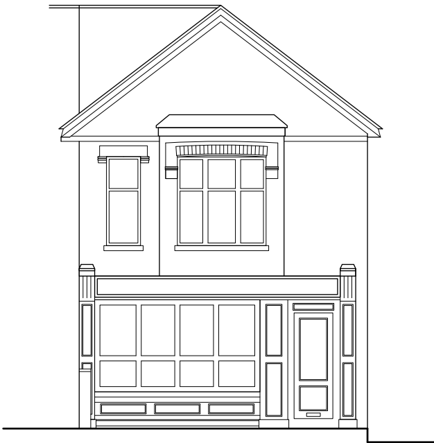
1 PRE-EXISTING NORTH- COWLEY MILL ROAD ELEVATION Scale: 1:100