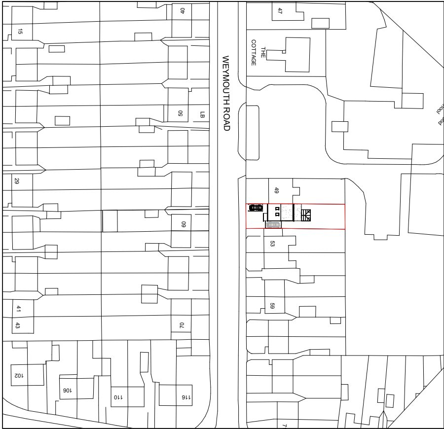
PP-EXISTING LOCATION PLAN 1 : 1250