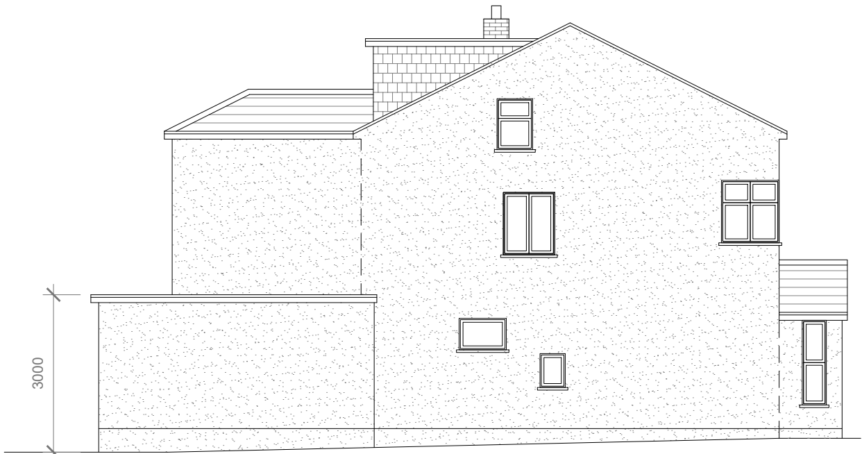
Proposed Side Elevation Scale 1:100