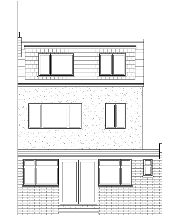
Existing Rear Elevation Scale 1:100