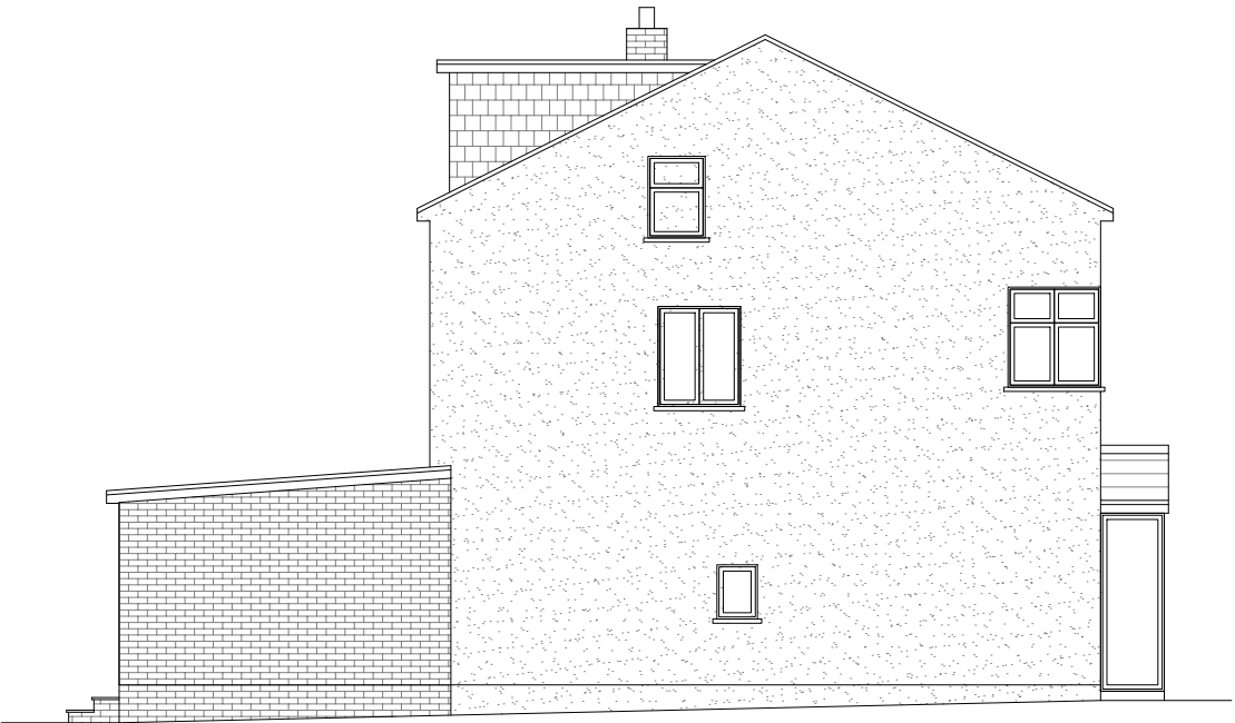
Existing Side Elevation Scale 1:100