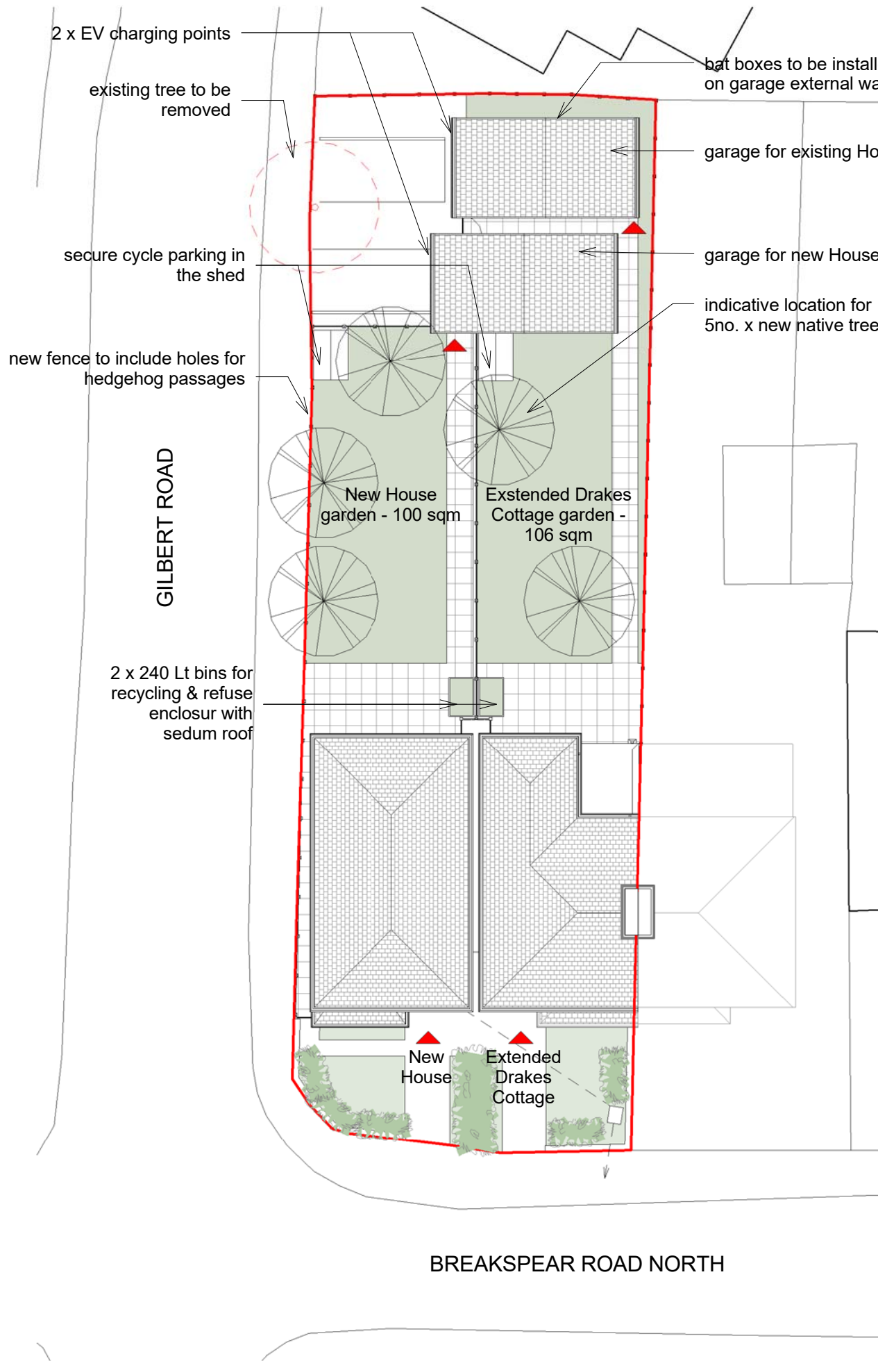
proposed site plan