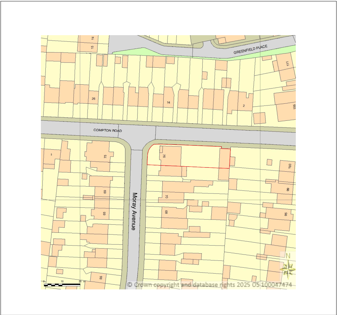
Location Plan @ 1:1250

Retrospective application to retain front extension of Outbuilding along with use of Outbuilding as Granny Annexe