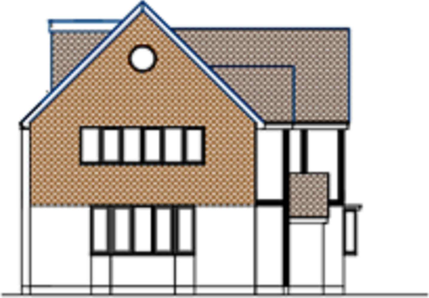
Side Elevation (no change/ not visible)