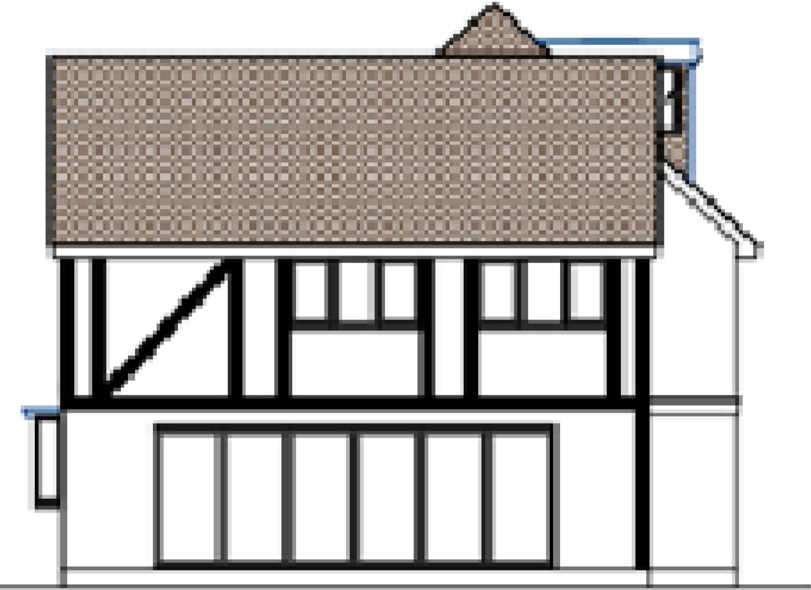
Side Elevation (no change/ not visible)