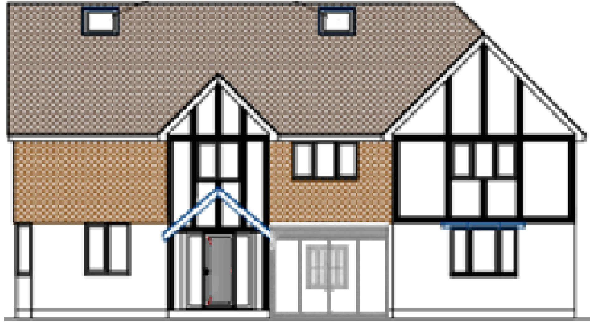
Proposed front Elevation (Facing Croft Gardens)