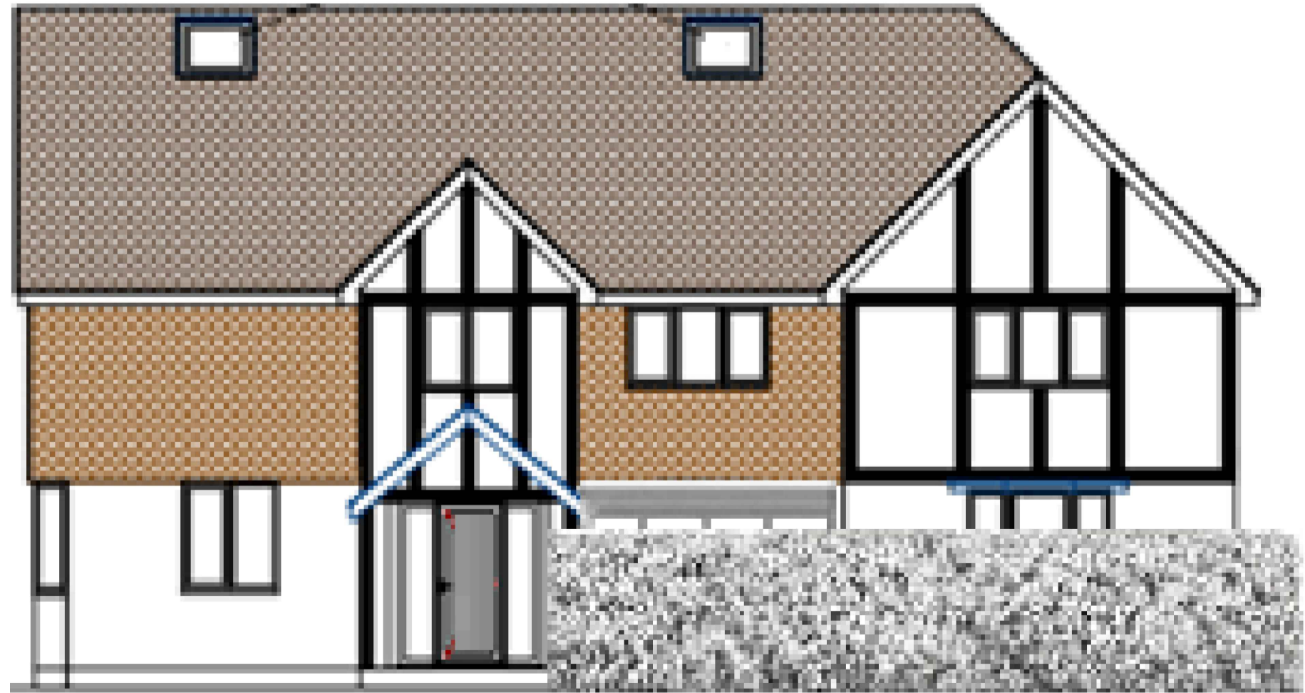
Proposed front Elevation (Facing Croft Gardens)