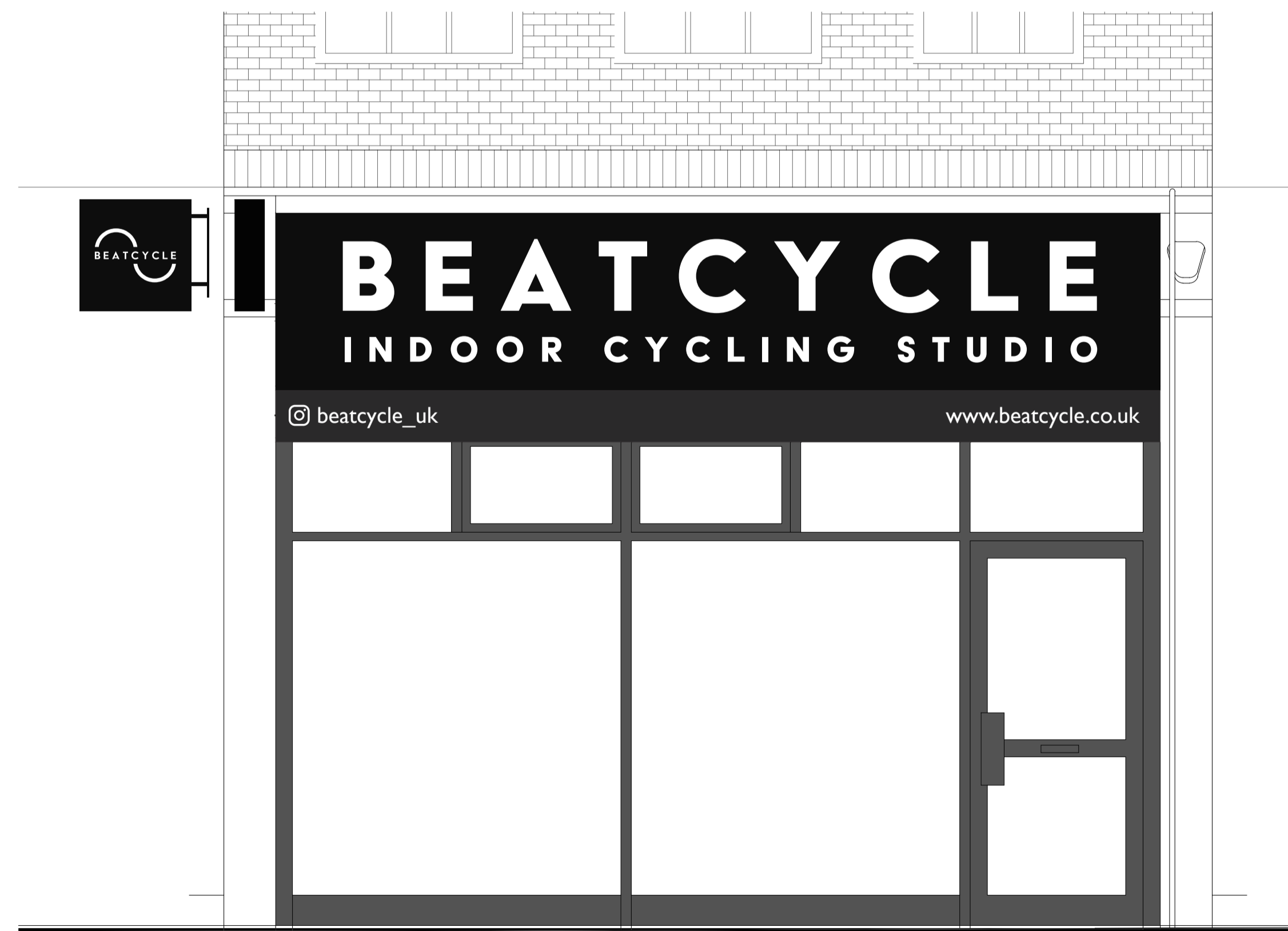
3 PROPOSED STREET FRONTAGE Scale: 1:25