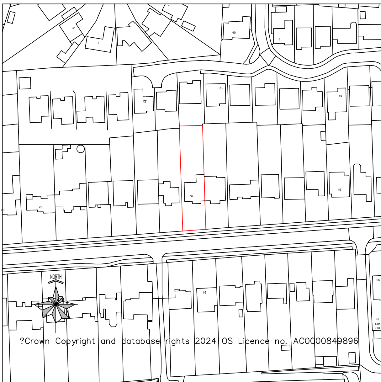
LOCATION PLAN SCALE 1:1250@A1