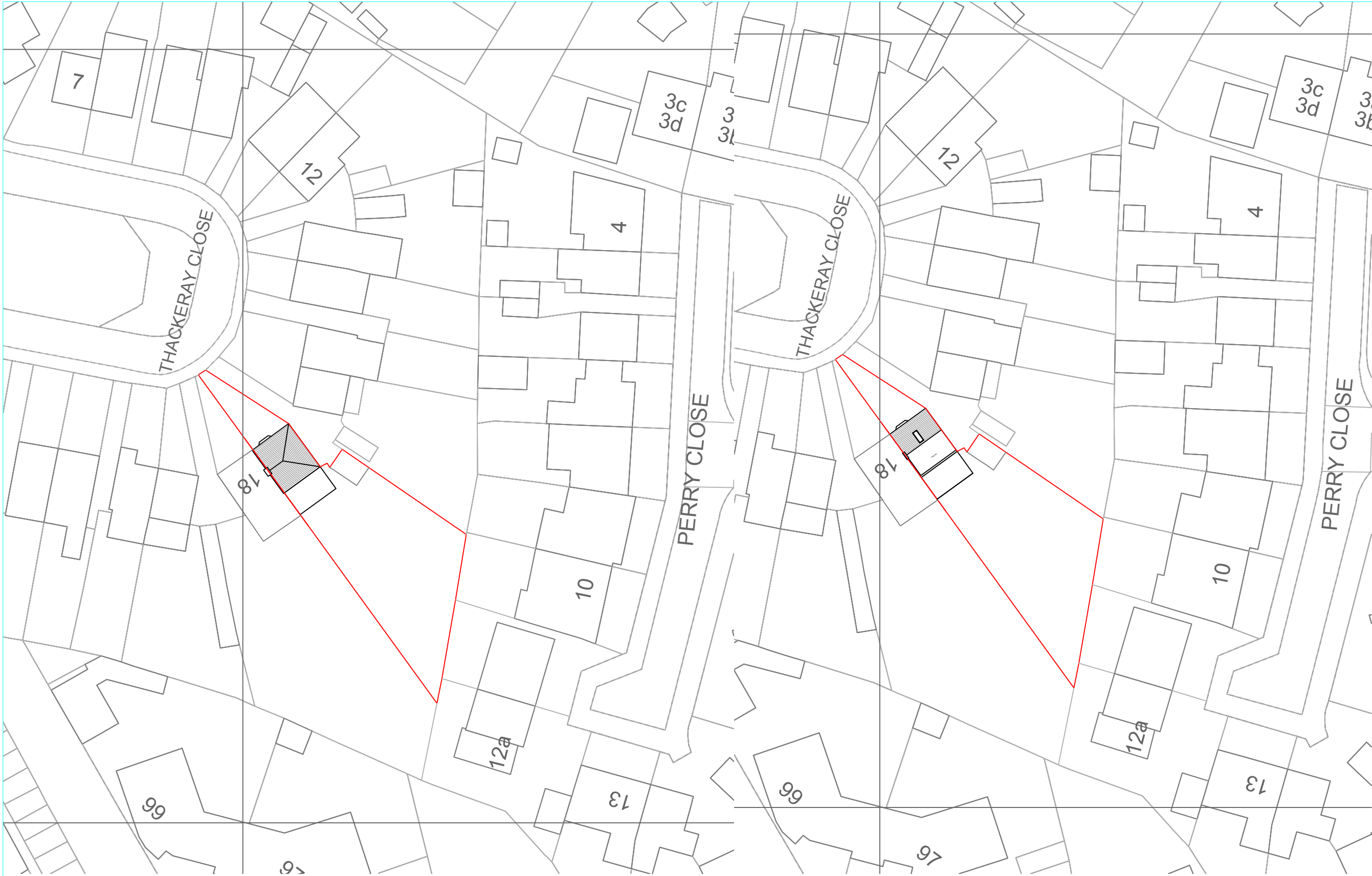
2 EXISTING BLOCK PLAN SCALE 1:500 @ A3