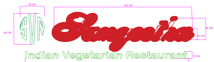
Alphabets and Wording details of Main Box Sign Board @1:50