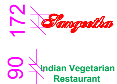
Projected Sign Board Letters Details @1:50

Retrospective application for Flue Outlet