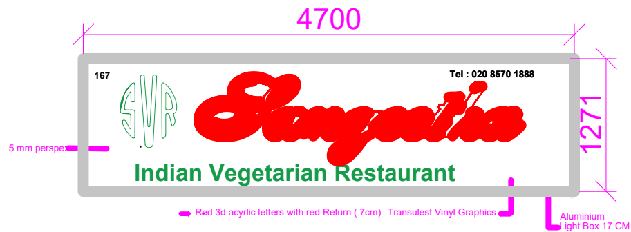
Box Sign Dimensions and Material details @1:50