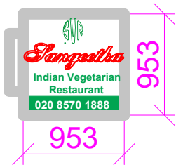
Projected Sign Board Details @1:50