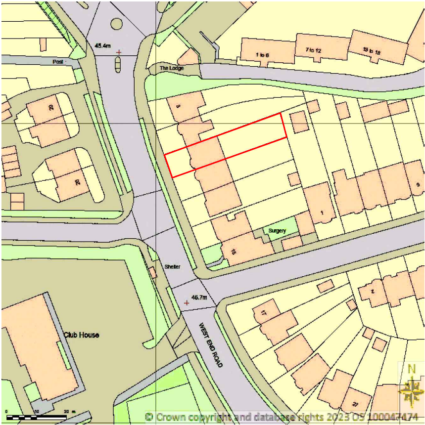
LOCATION MAP (1:1250)