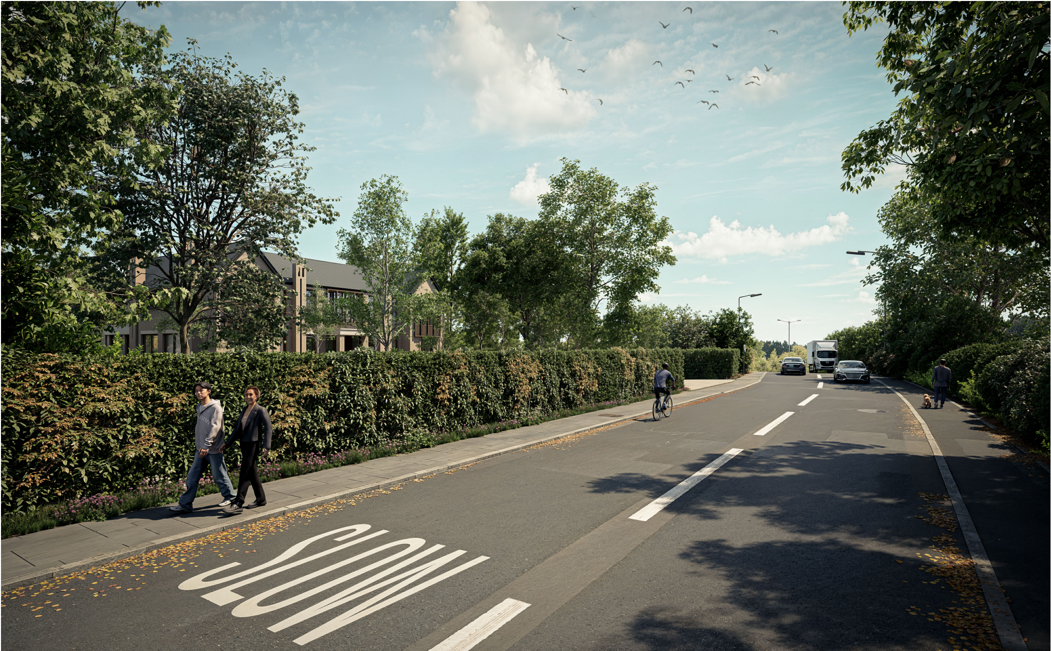
01 PROPOSED STREET VIEW NTS@ A3