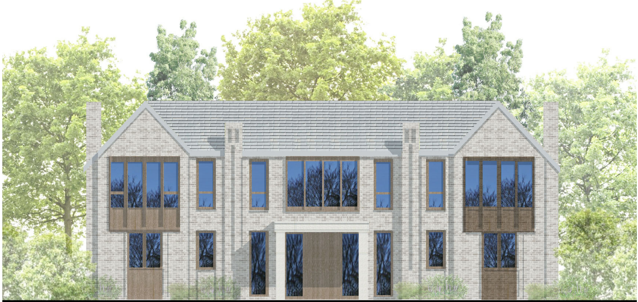
01 PROPOSED FRONT VIEW NTS@ A3