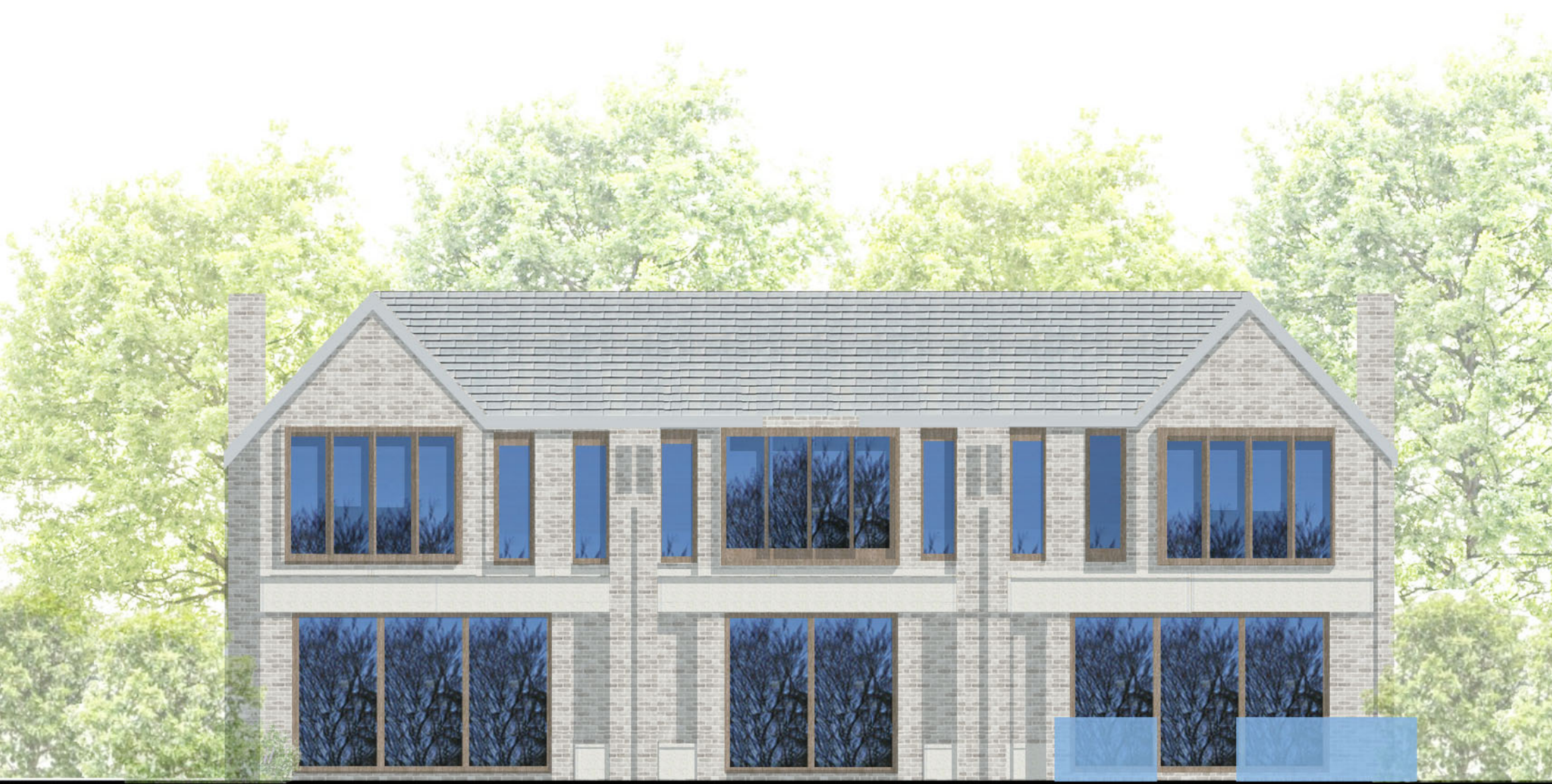
02 PROPOSED REAR VIEW NTS@ A3