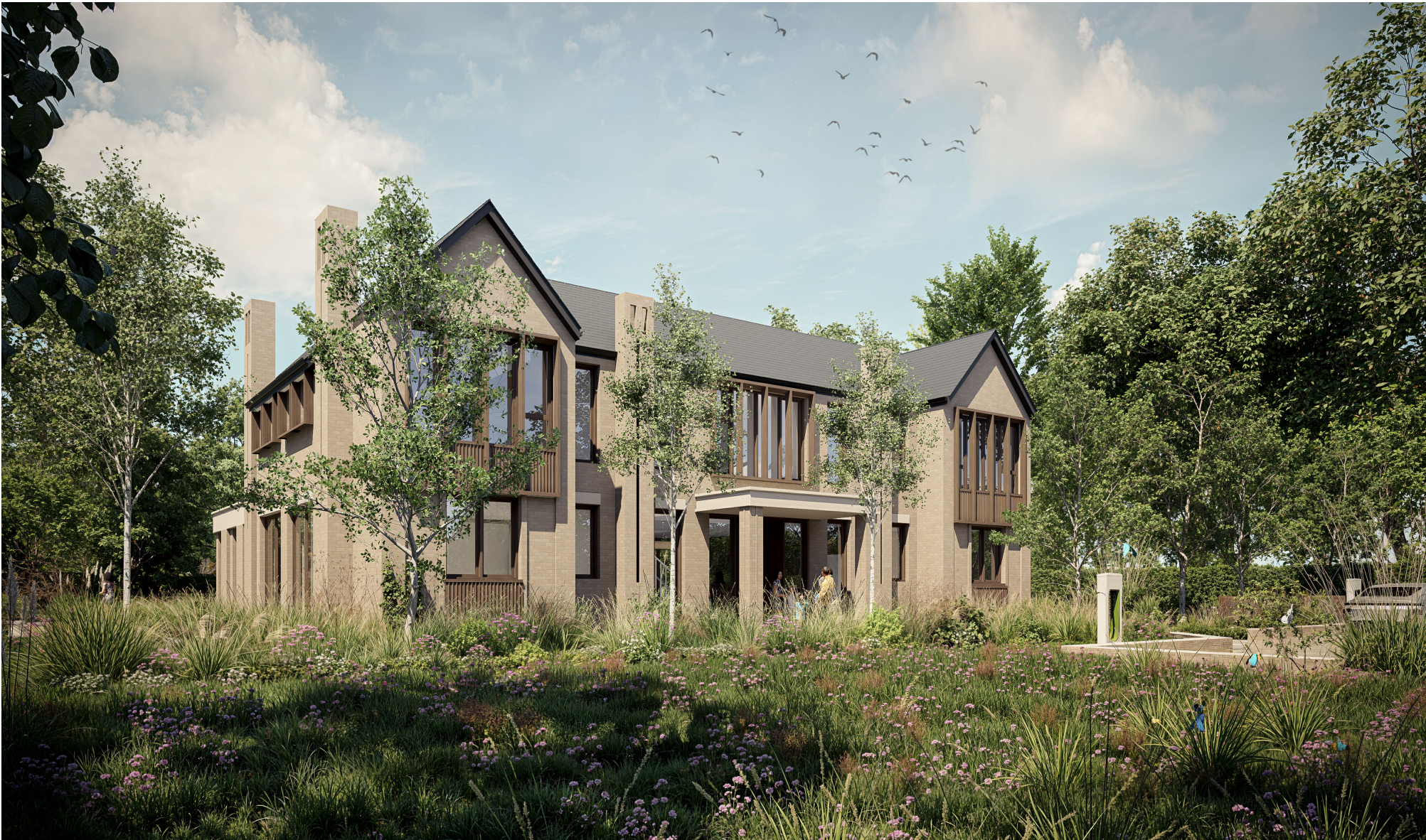
01 PROPOSED FRONT VIEW NTS@ A3