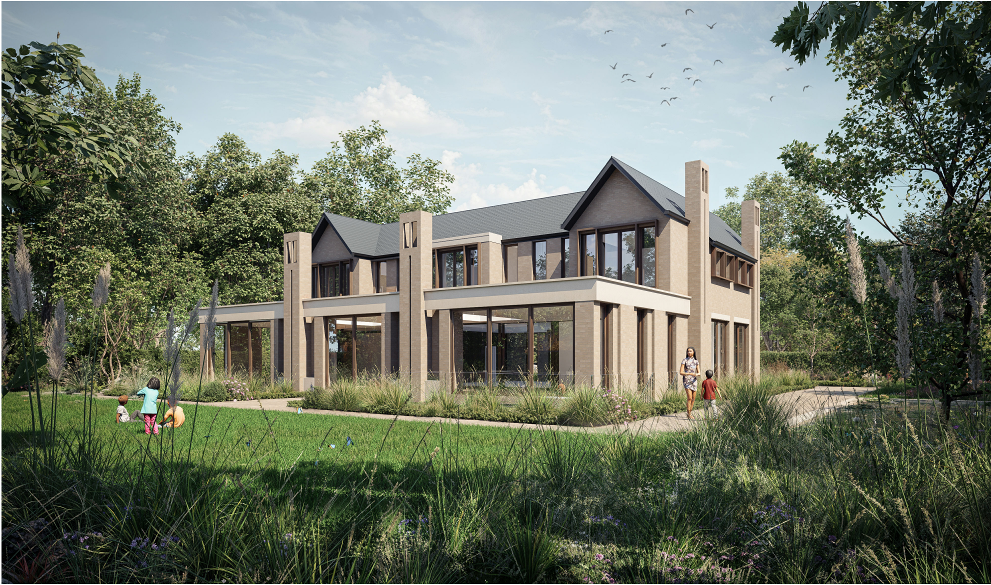
02 PROPOSED REAR VIEW NTS@ A3