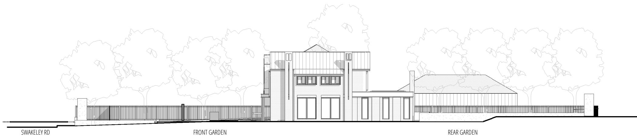
01 PROPOSED NORTH/ SITE ELEVATION 1:200 @ A3