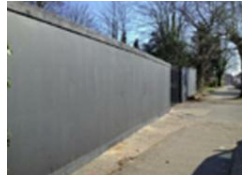
FIG 1. SITE HOARDING EXAMPLE