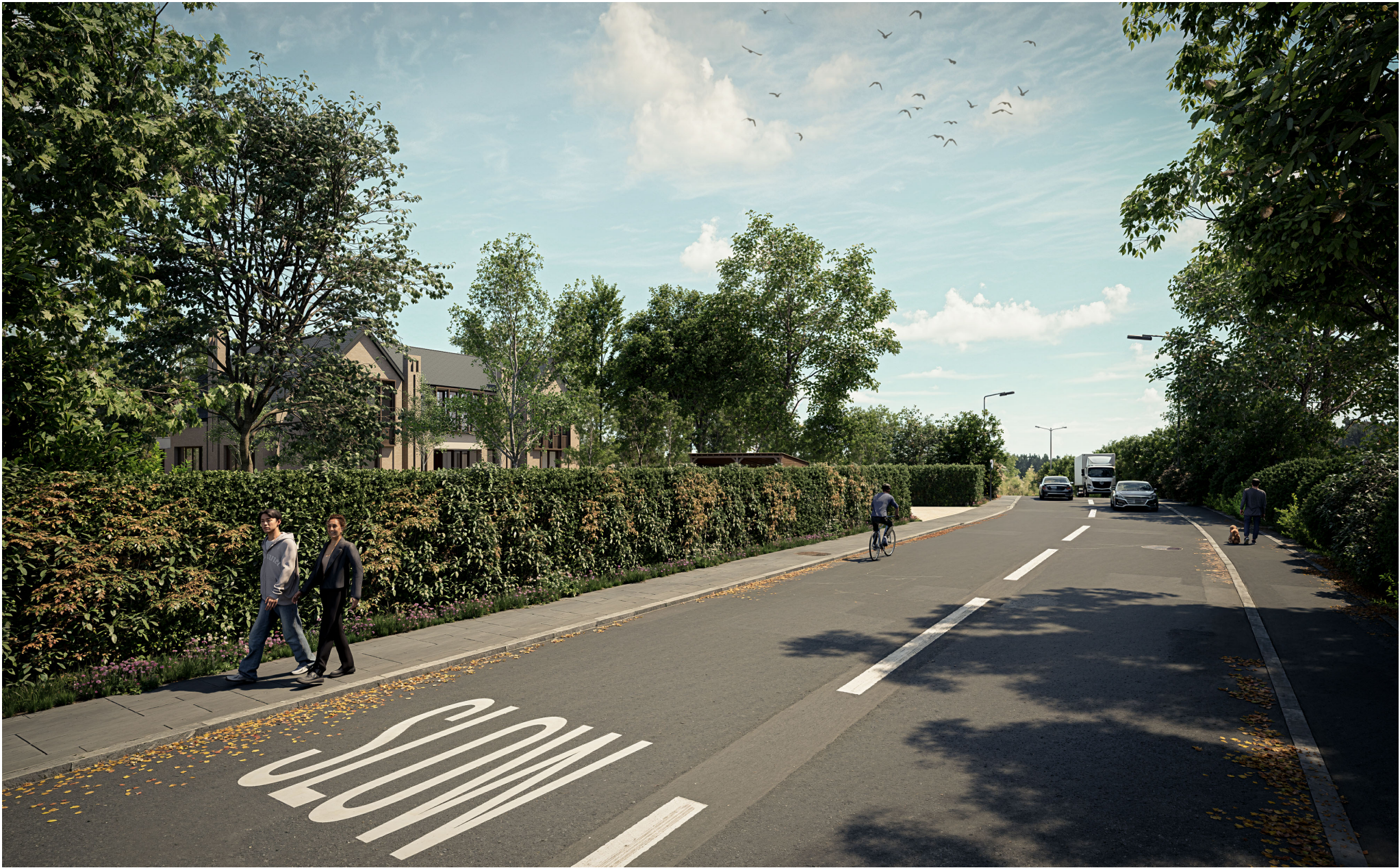
01 PROPOSED STREET VIEW NTS@ A3