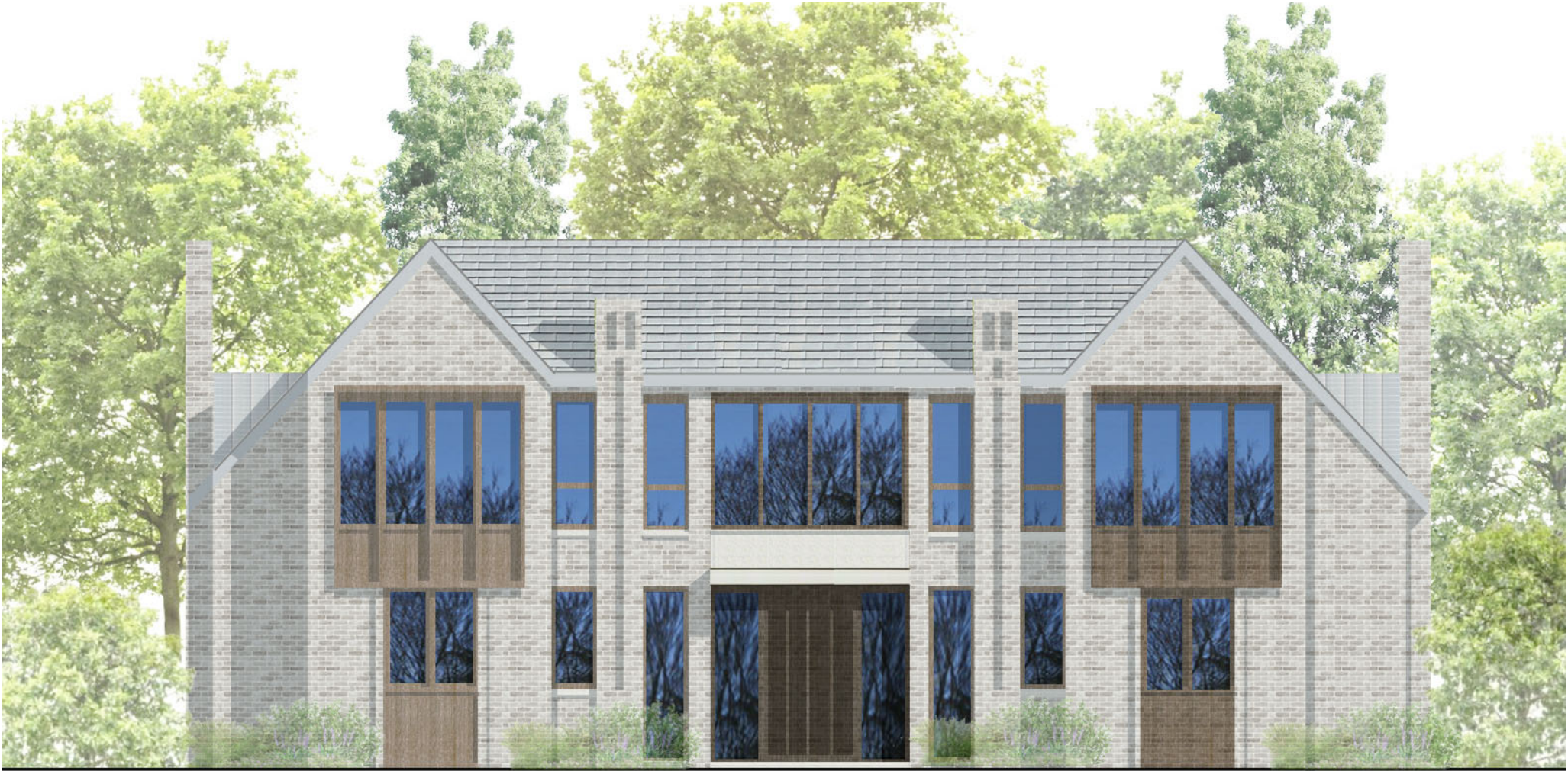
01 PROPOSED FRONT VIEW NTS@ A3