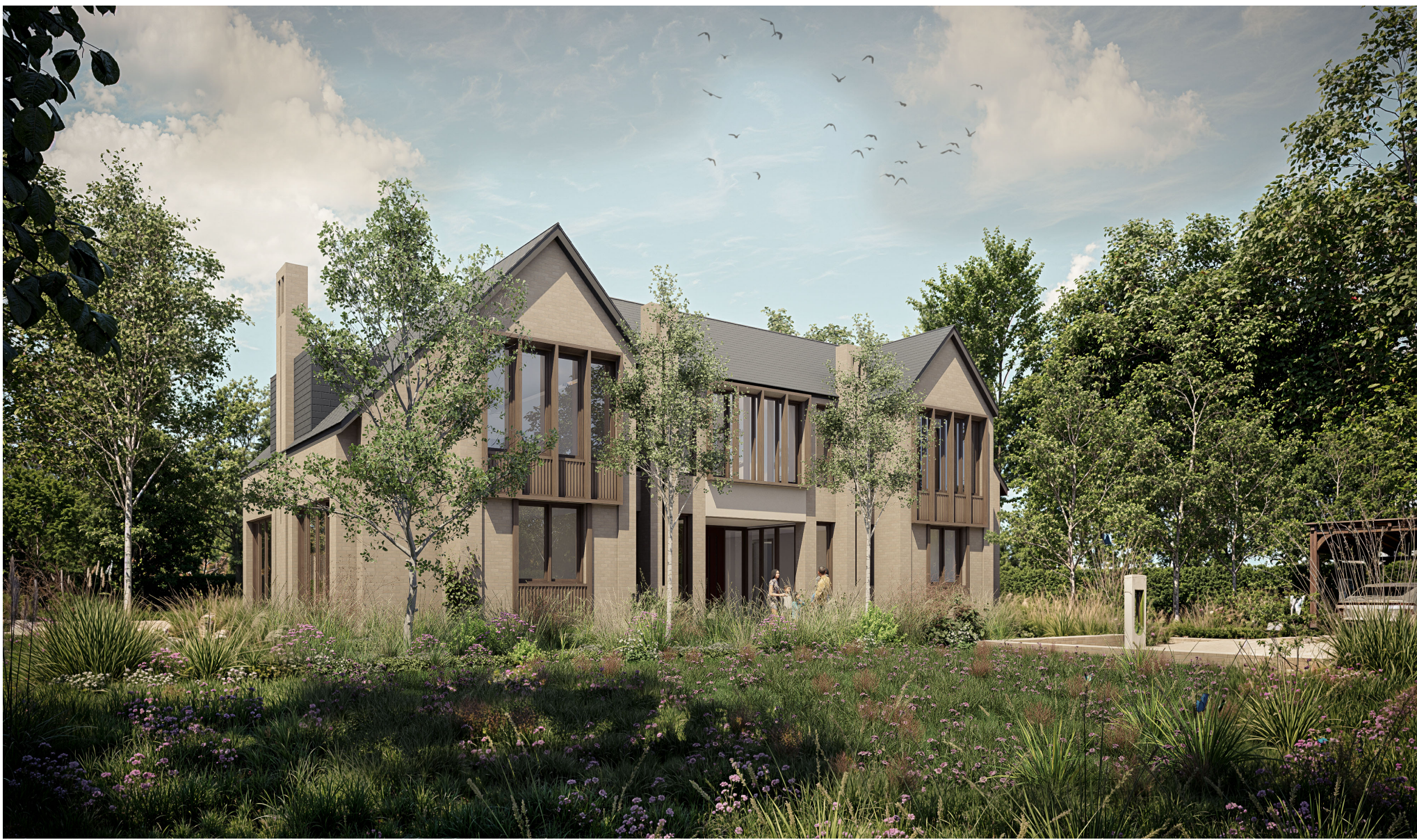
01 PROPOSED FRONT VIEW NTS@ A3