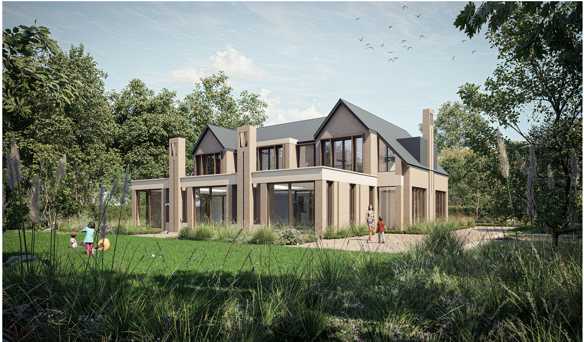
02 PROPOSED REAR VIEW NTS@ A3