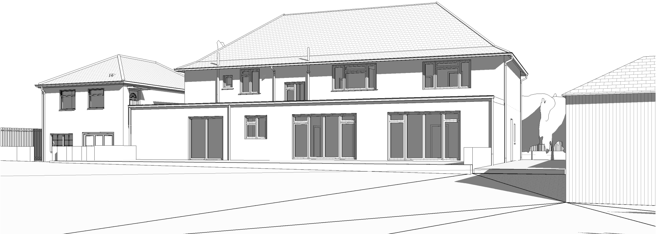
02 EXISTING REAR ELEVATION 1:100 @ A3