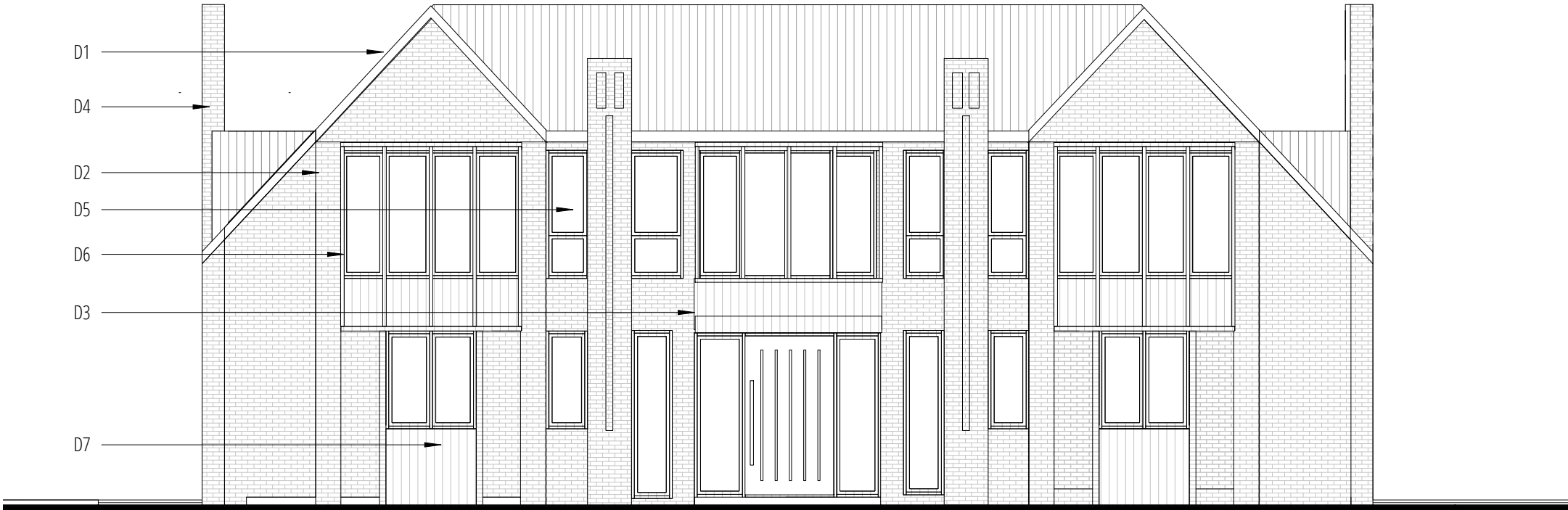
02 PROPOSED FRONT ELEVATION 1:200 @ A3