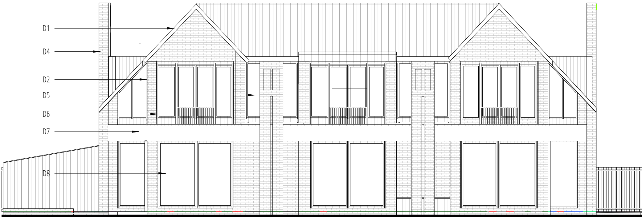
02 PROPOSED REAR ELEVATION 1:200 @ A3