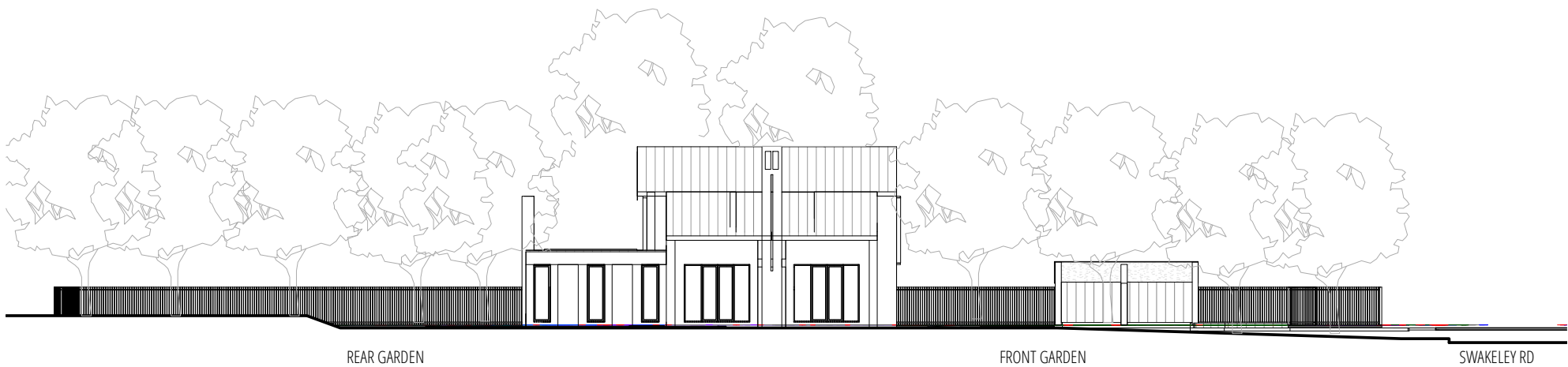
01 PROPOSED SOUTH SITE ELEVATION 1:300 @ A3