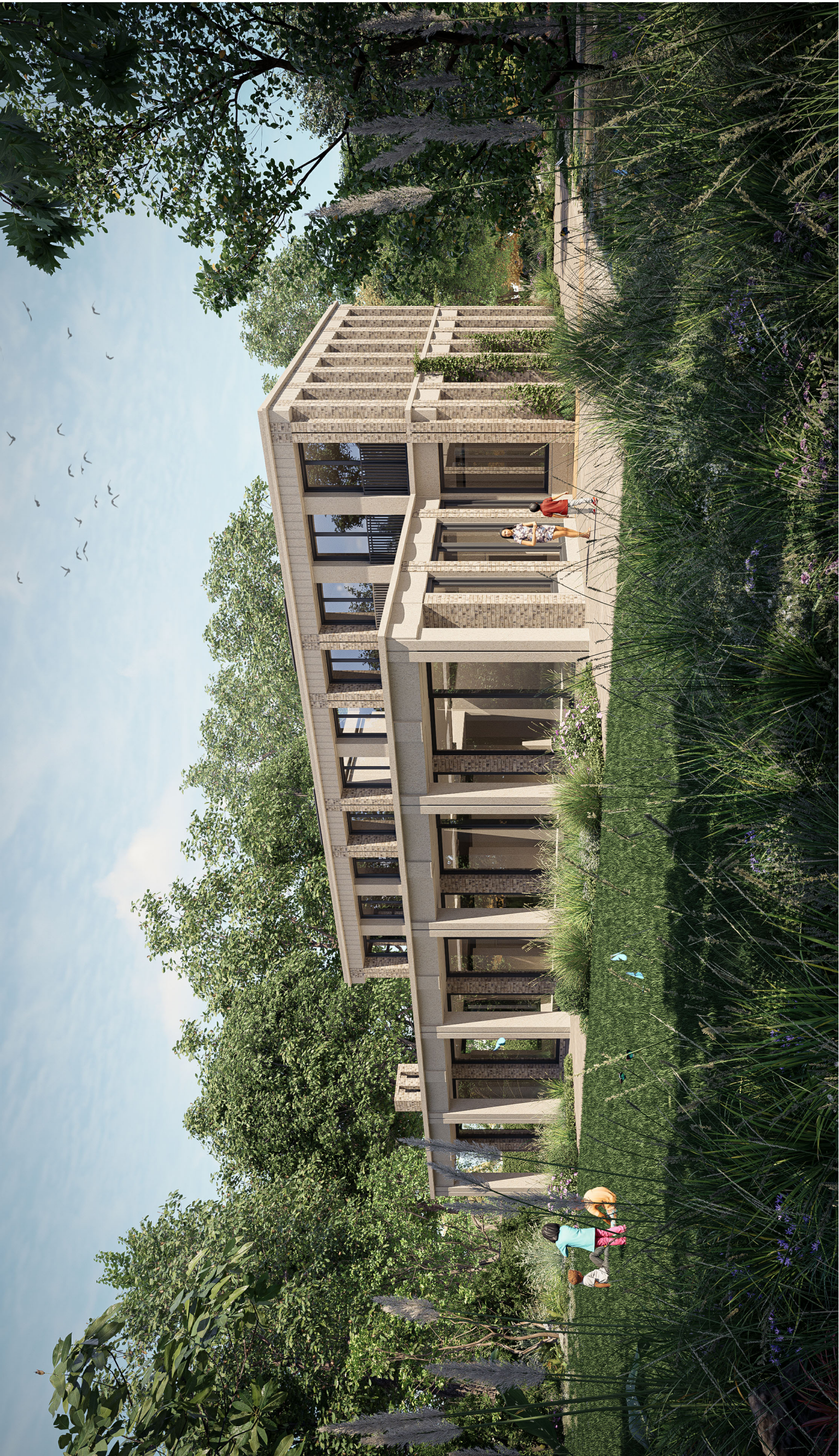
01 PROPOSED REAR VIEW NTS@A3