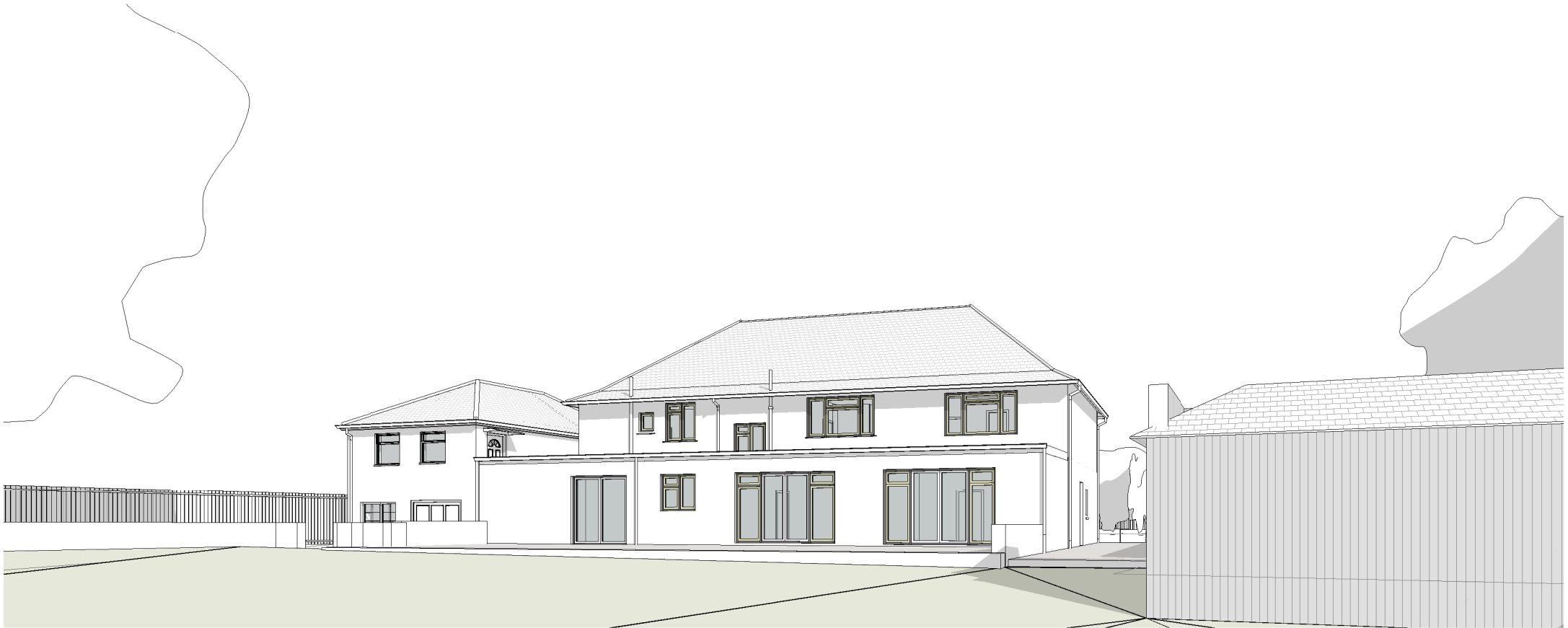
02 EXISTING REAR VIEW 1:200 @ A3