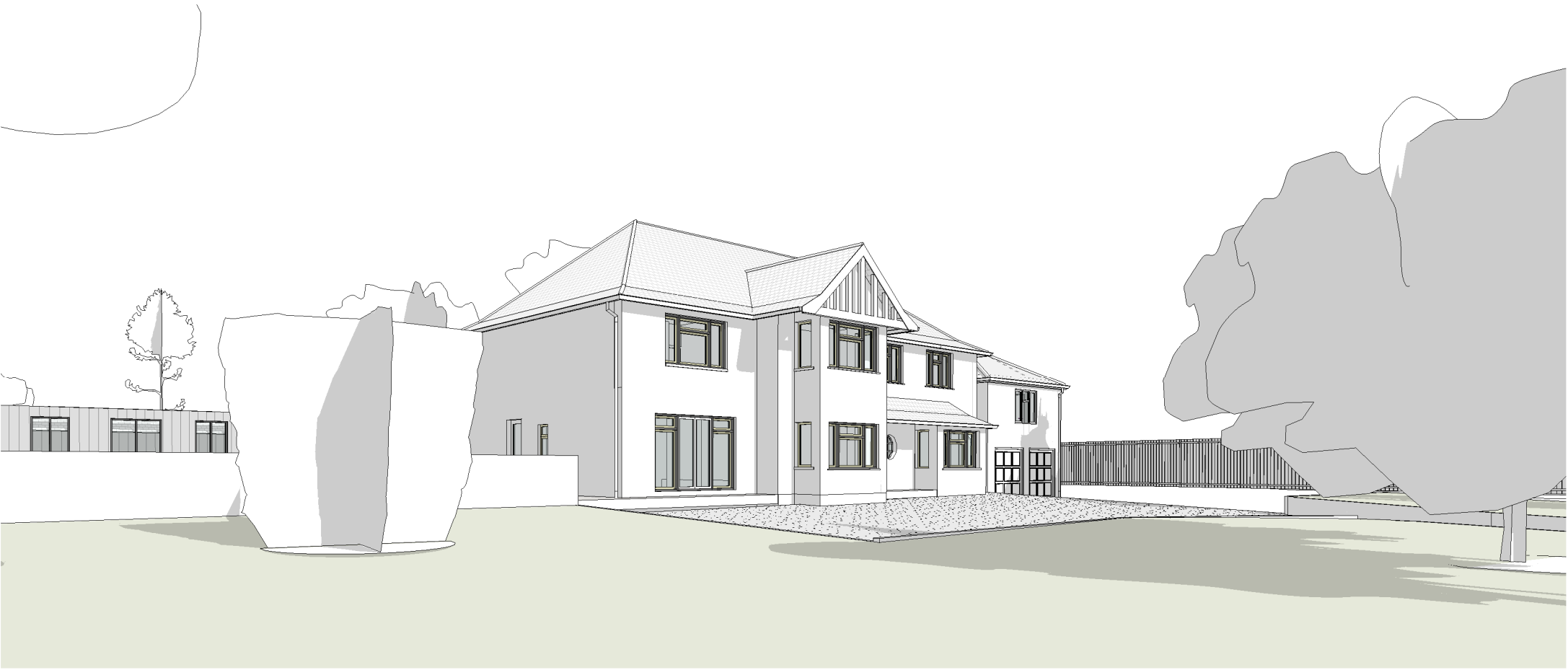
01 EXISTING FRONT VIEW 1:200 @ A3