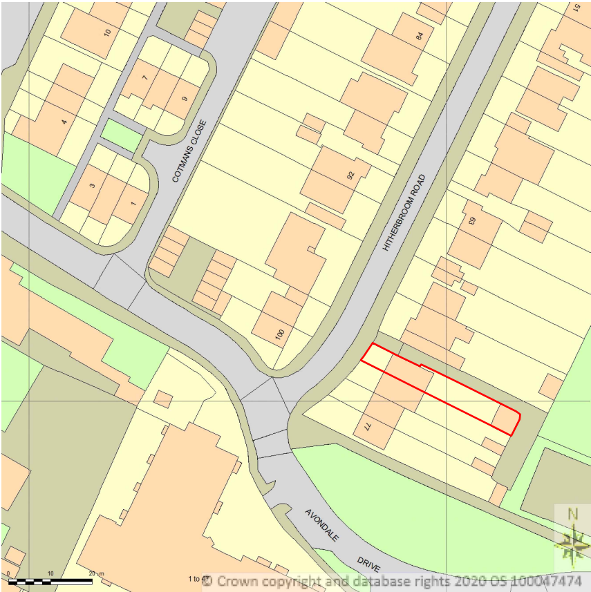
Location Plan@ 1:1250