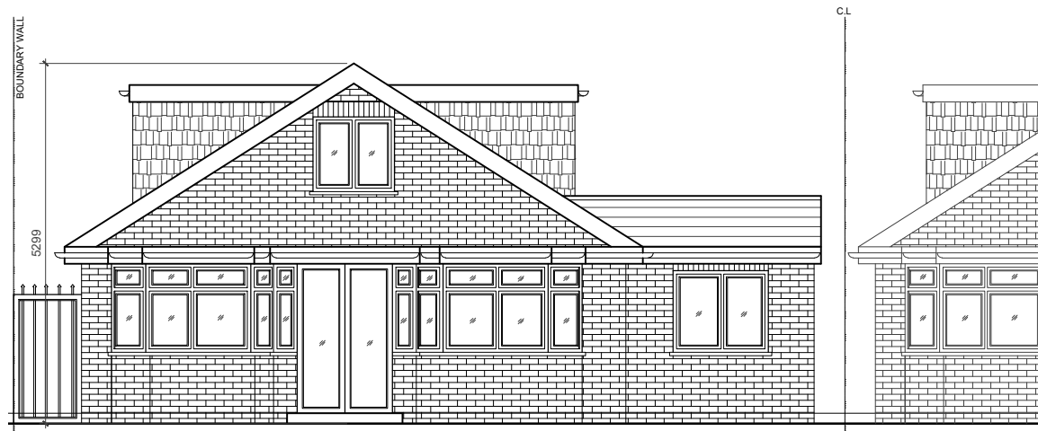
01 - FRONT ELEVATION