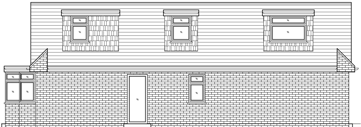
04 - RIGHT SIDE ELEVATION