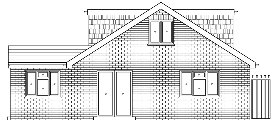
03 - REAR ELEVATION