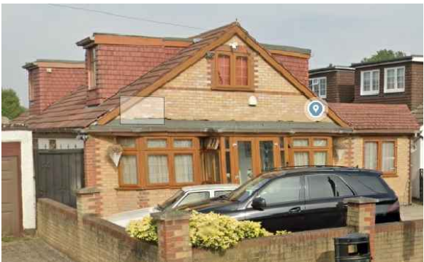
06 - SIDE VIEW