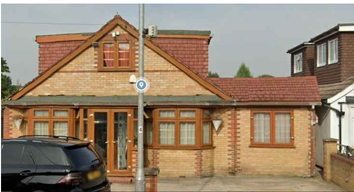
04 - FRONT VIEW