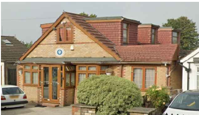
05 - SIDE VIEW