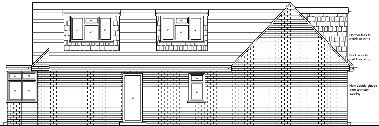
04 -RIGHT SIDE ELEVATION