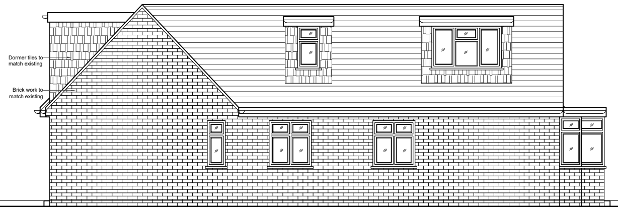
03 -LEFT SIDE ELEVATION