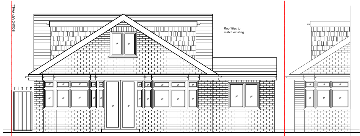
01 -FRONT ELEVATION